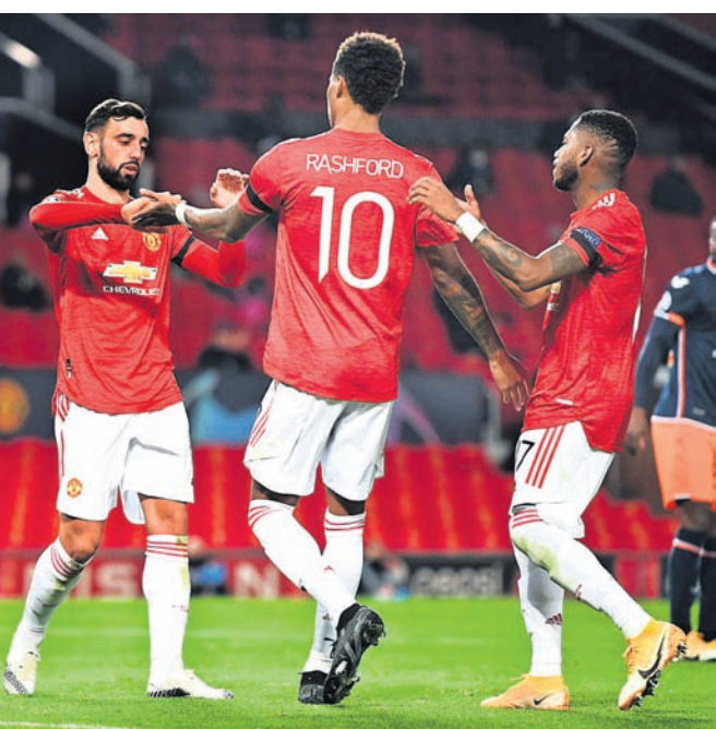
Bruno Fernandes (L) is congratulated by the other scorer Marcus Rashford and another teammate, Tuesday

Manchester, Nov 25: Marcus Rashford has become something of a national hero in Britain because of his campaigning for free school meals for poor students. At Old Trafford Tuesday, the Manchester United star was the beneficiary of a charitable gesture by a teammate. Bruno Fernandes had already scored two early goals against Istanbul Basaksehir in the Champions League when he was given the chance to complete a hat-trick — his first for United — from the penalty spot following a foul on Rashford. Instead, Fernandes handed over spot-kick duties to Rashford, who duly converted to set United on their way to a 4-1 win. The Portugal international, it seems, is a man of his word. "Of course every player wants to do a hat-trick," Fernandes said, "but after the (last) game in the Premier League, I told Rashford the next one he will take and so I remembered that." Fernandes said he also wanted Rashford to improve his chances of being the leading scorer in the competition this season. He is now on five goals in the group stage, after a late winner against Paris Saint-Germain and a hat trick against Leipzig. United was never in danger of