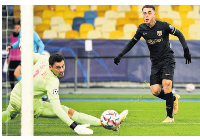
SUBLIME FINISH: Sergino Dest strikes past Dynamo Kyiv goalie for Barcelona's first goal in the match; Martin Braithwaite celebrates after one of his goals

Kyiv (Ukraine), Nov 25: American defender Sergino Dest scored his first goal with Barcelona as the Catalan club comfortably defeated Dynamo Kyiv 4-0 and advanced to the knockout stage of the Champions League despite the absence of Lionel Messi. Martin Braithwaite scored twice and Antoine Griezmann once as Barcelona secured a spot in the last 16 of the European competition for the 17th straight season. Barcelona reached 12 points from four victories in Group G. It has a three-point lead over Juventus, who beat Hungarian club Ferencvaros 2-1 at home. Dynamo and Ferencvaros stayed at one point each and have no chance of advancing with two rounds of matches remaining. Dest scored for the first time since signing with Barcelona in October with a low cross shot into the far corner in the 52nd minute. Braithwaite added to the lead from