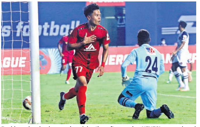
Rochharzela wheels away in celebration after scoring NEUFC's second goal as East Bengal custodian looks dejected, Saturday