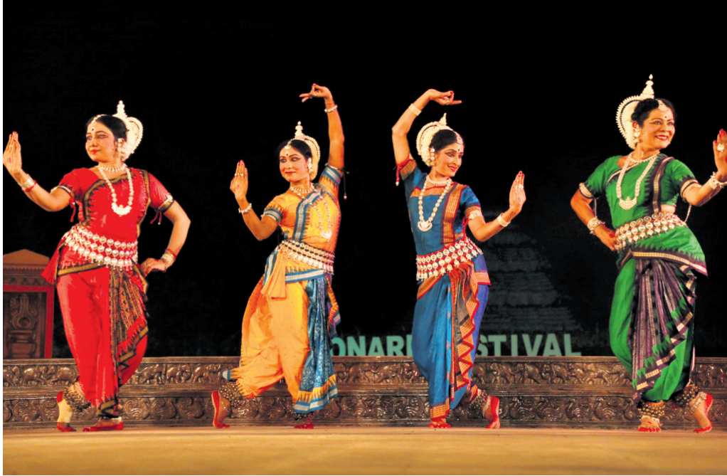
Dancers performing on the concluding day of Konark Festival, Saturday