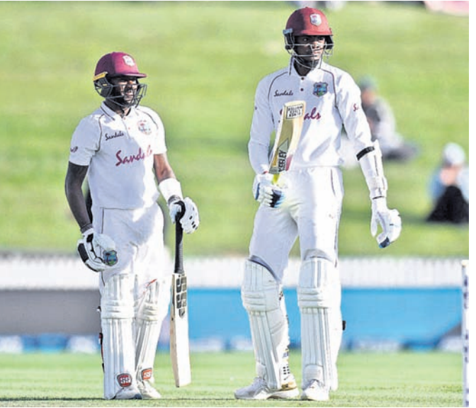
Alzarri Joseph raises his bat after completing his maiden Test fifty as Jermaine Blackwood looks on

Hamilton, Dec 5: New Zealand's push for an innings victory over the West Indies in the first cricket test was stalled on the third day Saturday by a bold, counter-attacking partnership for the tourists' seventh wicket between Jermaine Blackwood and Alzarri Joseph. New Zealand seemed to be coasting to a win within three days when captain Kane Williamson enforced the follow-on with a 381-run lead after dismissing the West Indies for 138 in reply to its first innings of 519/7 declared. When the West Indies were reduced to 30/4 at tea, then 89/6 in their second innings it seemed they were fated to become only the fifth team in Test history to be dismissed twice in one day. Their position was more dire because wicketkeeper Shane Dowrich could not bat in either innings because of a broken finger and they have only nine wickets. But Blackwood and Joseph combined in an unbroken partnership