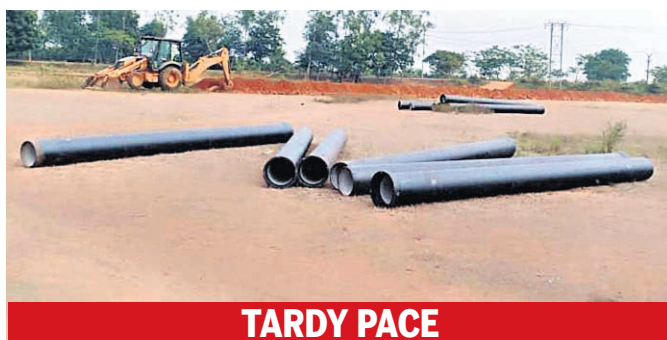
TARDY PACE A report said, these projects envisage lifting of water from Brahmani, Genguti, Baitarani and Kharasrota rivers A joint inspection report on lifting river water for drinking purpose has been submitted by RWSS to its chief engineer November 11, 2020 The water resources department has given its stamp of approval to two projects only while six other projects are pending approval Aother project is going to be set up in Dasharathpur block to provide 7.75 cusecs of safe drinking water to 33 villages

POST NEWS NETWORK Jajpur, Dec 5: The state government has planned eight mega drinking water projects in Jajpur district to ensure safe drinking water to people, but approval has been given to only two projects while six are awaiting approval, a report said. According to a report, these projects envisage lifting of water from Brahmani, Genguti, Baitarani and Kharasrota rivers. A joint inspection report on lifting river water for drinking purpose has been submitted by RWSS to its chief engineer November 11, 2020. The water resources department has given its stamp of approval to two projects only while six other projects are pending approval. One of the two projects which has got approval is aimed at providing water to 43 villages under Barchana block and 45 villages under Dharmashala block. This project entails lifting 9.32 cusecs of water from Genguti. The other project is going to be set up in Dasharathpur block to