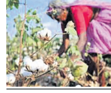
In the current year, the target was to raise cotton farming to 1,000 ha, but it has come down to 557 ha in nine major areas of Ganjam district