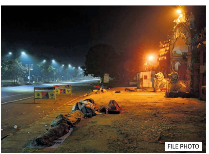
'The homeless or individuals sleeping in open are reluctant to stay in a shelter for urban homeless'