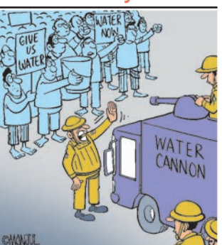
No water cannon on these protesters... only lathi charge