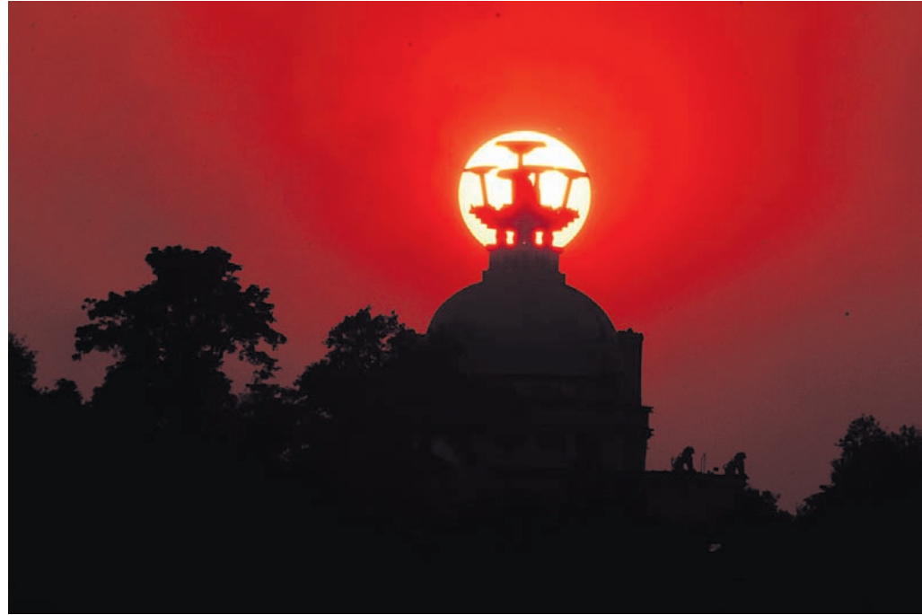
The White Peace Pagoda of Dhaulvi stupa is a sight to behold against the backdrop of a setting sun in Bhubaneswar, Saturday