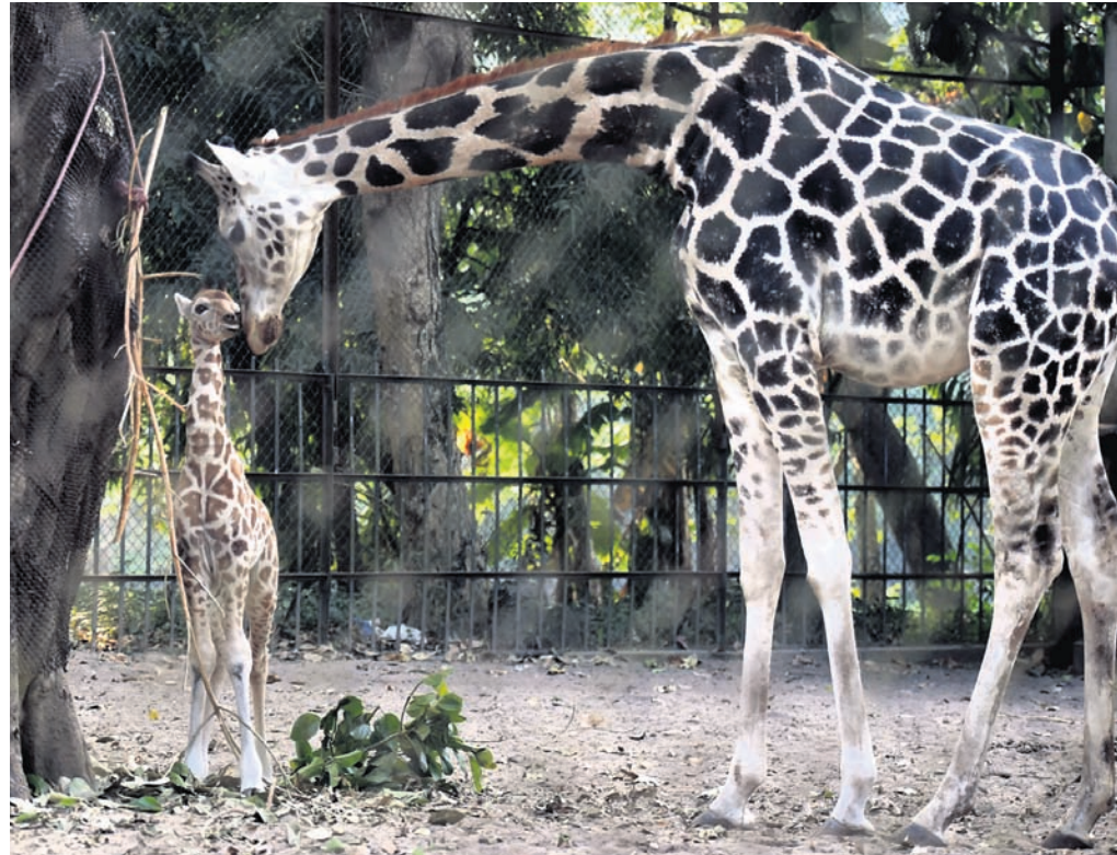
A giraffe calf with her mother at Alipore Zoological Garden in Kolkata, Saturday