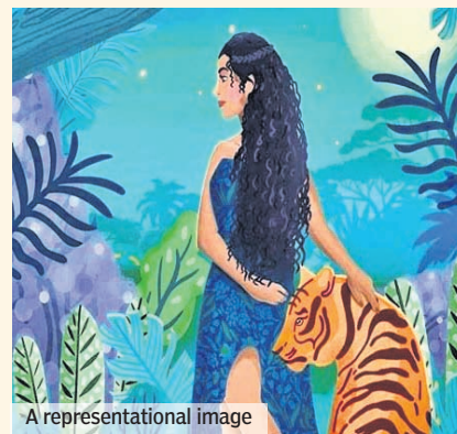
A representational image

Instagram is one of the most popular social networks worldwide. This visual medium is not just a photo gallery anymore it has transformed into a platform for creative expression, engagement and even a source of income for many.