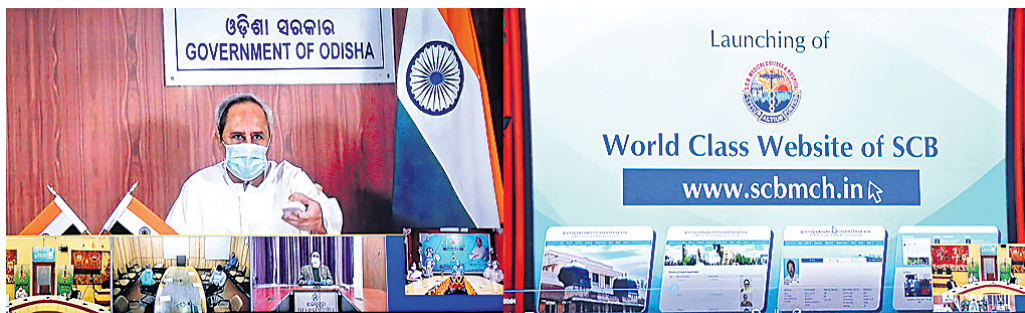
Chief Minister Naveen Patnaik launches the World Class Website of SCB through videoconferencing, Saturday

Stating that the medical college is a shining example of medical care for the poor and the needy, he said, "It is also the cradle of great medical talent. SCB is one of the oldest med-