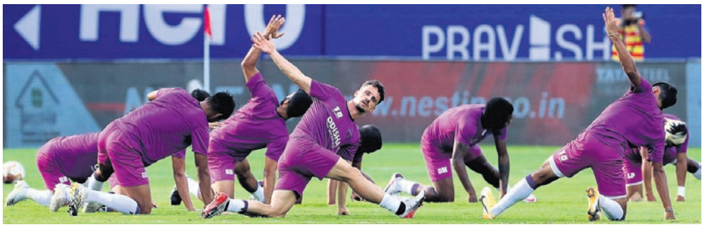
Odisha FC players go through their training drills ahead of their matchday