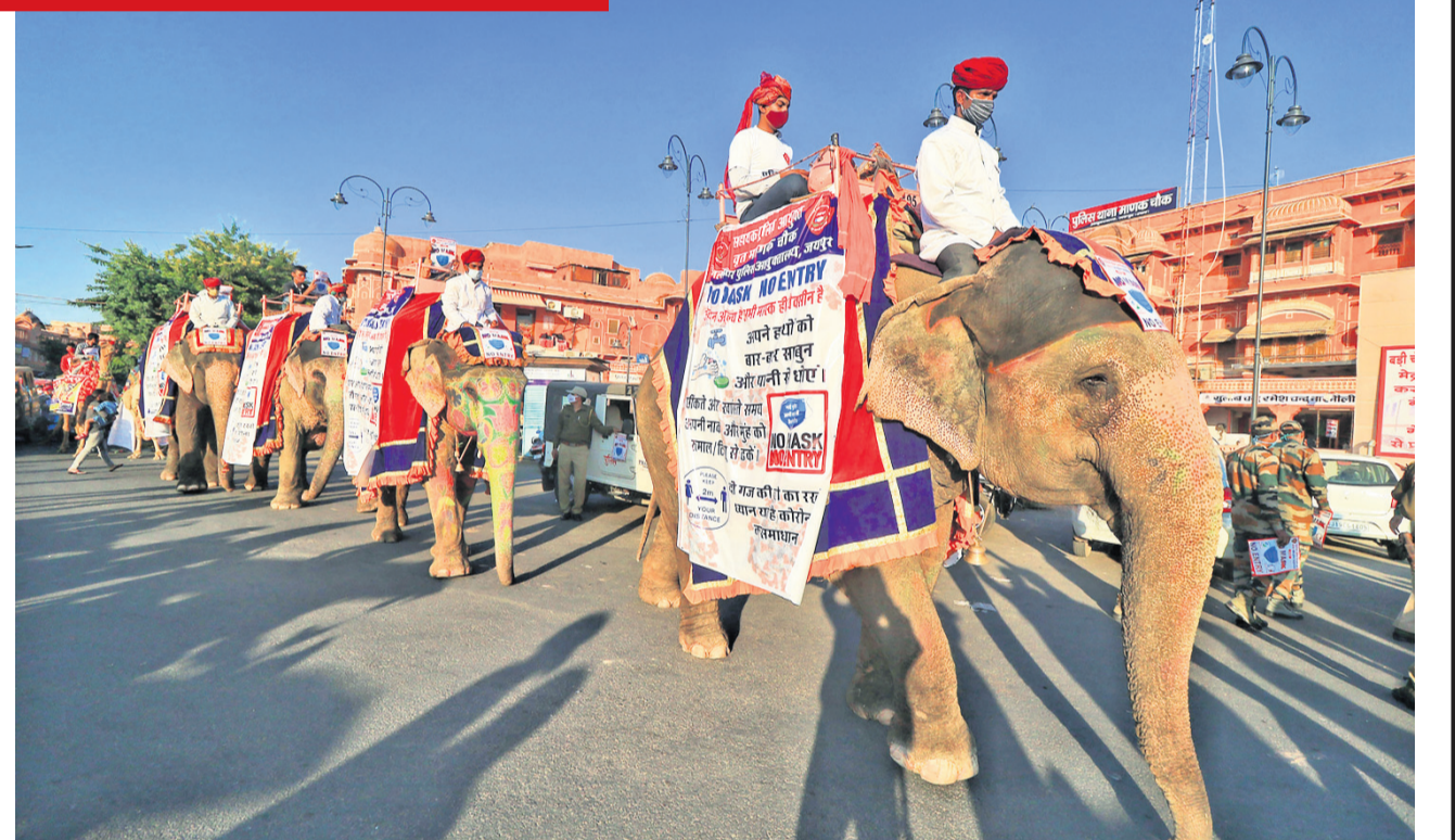
Rajasthan policemen ride on elephants during the ‘No Mask, No Entry’ campaign against Covid-19 at Badi Chaupar in Jaipur, Saturday.