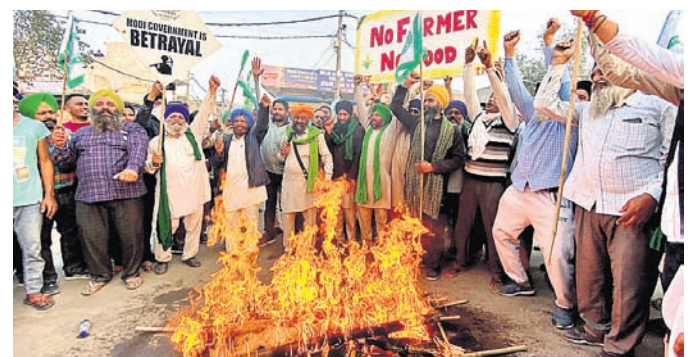
Farmers burn an effigy during their protest march against the Centre's new farm laws at Singhu border, in New Delhi, Saturday

India has called the remarks by foreign leaders on protests by farmers as "ill-informed" and "unwarranted" as the matter pertained to the internal affairs of a democratic country. "As to the question of India, what I would say to you is what I've said to others when raising these issues is that people have a right to demonstrate peacefully, and au-