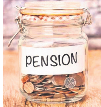
The pensions given by the SSEPD department includes pensions for disabled, sick, elderly transgender and others

After the government rolled back the decision to use Aadhaar for pension disbursement, the department found that disbursement of pension in favour of non-Aadhaar beneficiaries was made in excess of the reported total number of non-Aadhaar beneficiaries in these two districts. In a latest communication to the District Social Security Officers (DSSOs) of the two districts, the department has asked them to inquire into the matter. "You are therefore instructed to make an inquiry and weed out undeserving beneficiaries. Your inquiry report should reach the office within seven days of the receipt of the letter," the letter to DSSOs said. Earlier this year, the SSEPD department had issued a notification that those pensioners who have not seeded their Aadhaar with their pension accounts or do not hold Aadhaar cards would not be allowed pensions. However, after uproar the department had to roll back its order and allowed pensions without Aadhaar to receive their pension. It was anticipated that if non-