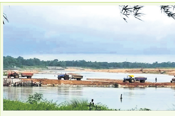
The petitioners in the case had alleged that villagers of Panchughanta in the district had been affected by the rampant and illegal sand mining in the areas

It also added, "There is also violation in respect of excavation of sand outside the demarcated area, mining close to the embankment of the river and portions of embankments of both sides of the river having been cut out for construction of roads." The NGT said the order of halting of sand mining operations is subject to final consideration of the affidavits and documents filed by the parties and the final hearing. The tribunal however allowed the State Pollution Control Board time to file an additional affidavit on the issue. Earlier, the tribunal had sought constitution of a committee to inspect the site. The Joint Inspection Committee after their visit to the site had given an adverse report to the NGT admitting serious violations on green rules during the process