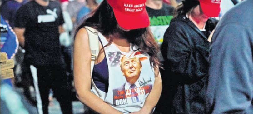
Supporters of President Donald Trump pause for prayer during a rally outside the Maricopa County Records Office in Phoenix