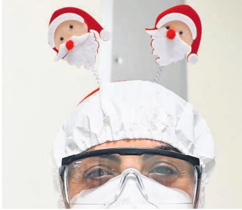
A medical worker in a protective suit works inside an intensive care unit for coronavirus patients at the San Filippo Neri hospital in Rome, Italy, on Christmas day