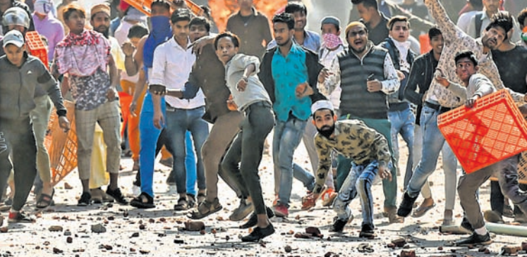
Protestors hurl brick-bats during clashes between a group of anti-CAA protestors and supporters of the new citizenship act, at Jafraabad in north-east Delhi