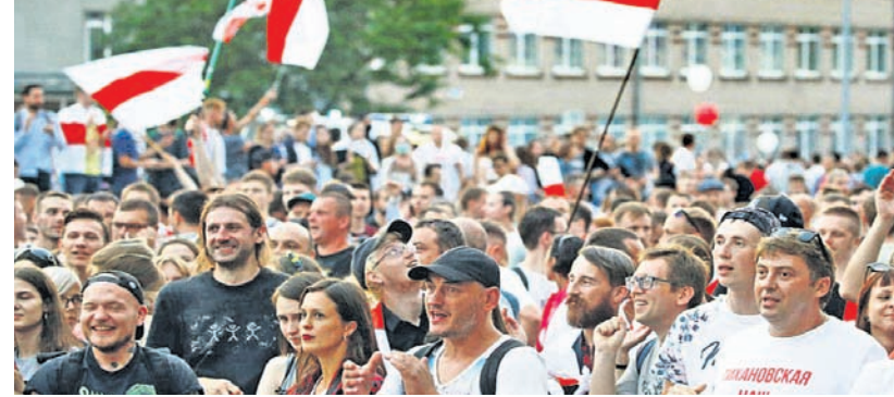
Belarus strongman President Alexander Lukashenko's disputed victory in August 9 elections sparks four months of anti-government protests, centred on his main rival, political novice Svetlana Tikhonovskaya. Opposition leaders were jailed or driven into exile.