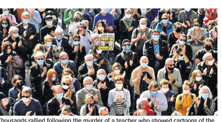
Thousands rallied following the murder of a teacher who showed cartoons of the Prophet Muhammad in class