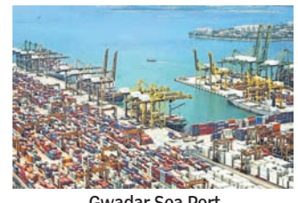
Gwadar Sea Port

Overall lending by the state-backed China Development Bank and the Export-Import Bank of China declined from a peak of $75 billion in 2016 to just $4 billion last year. Provisional 2020 figures show that amount shrunk to around $3