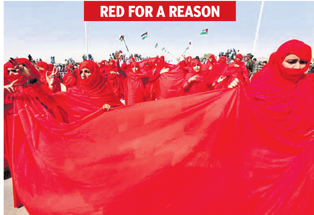
Sahrawi women take part in a parade organised by the Polisario Front independence movement at the Awererd refugee camp in Tindouf, Algeria

The Saudi-led coalition earlier said it intercepted 12 armed drones aimed at "civilian targets" without specifying a location as well as two ballistic missiles fired towards Jazan. The Eastern Province is home to most of Aramco's production and export facilities. In 2019, Saudi Arabia, the world's top oil exporter, was shaken by a big missile and drone attack on oil installations just a few km (miles) from the facilities hit on Sunday, which Riyadh blamed on Iran, a charge Tehran denies.