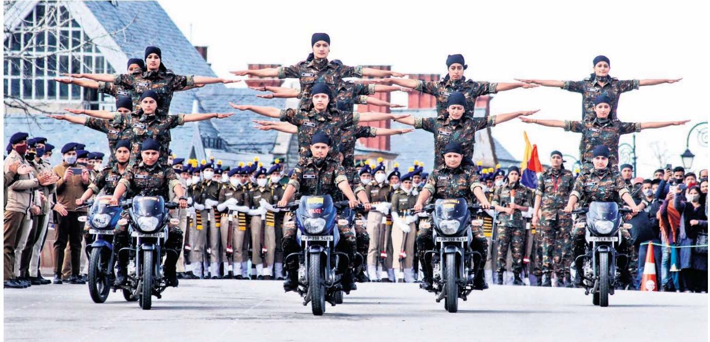
Women officers of Himachal Pradesh police perform stunts on the occasion of International Women's Day, during an event at the Ridge, in Shimla