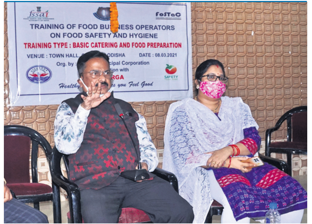
Hosted by CMC, a workshop on food safety in progress at Town Hall in Cuttack, Monday