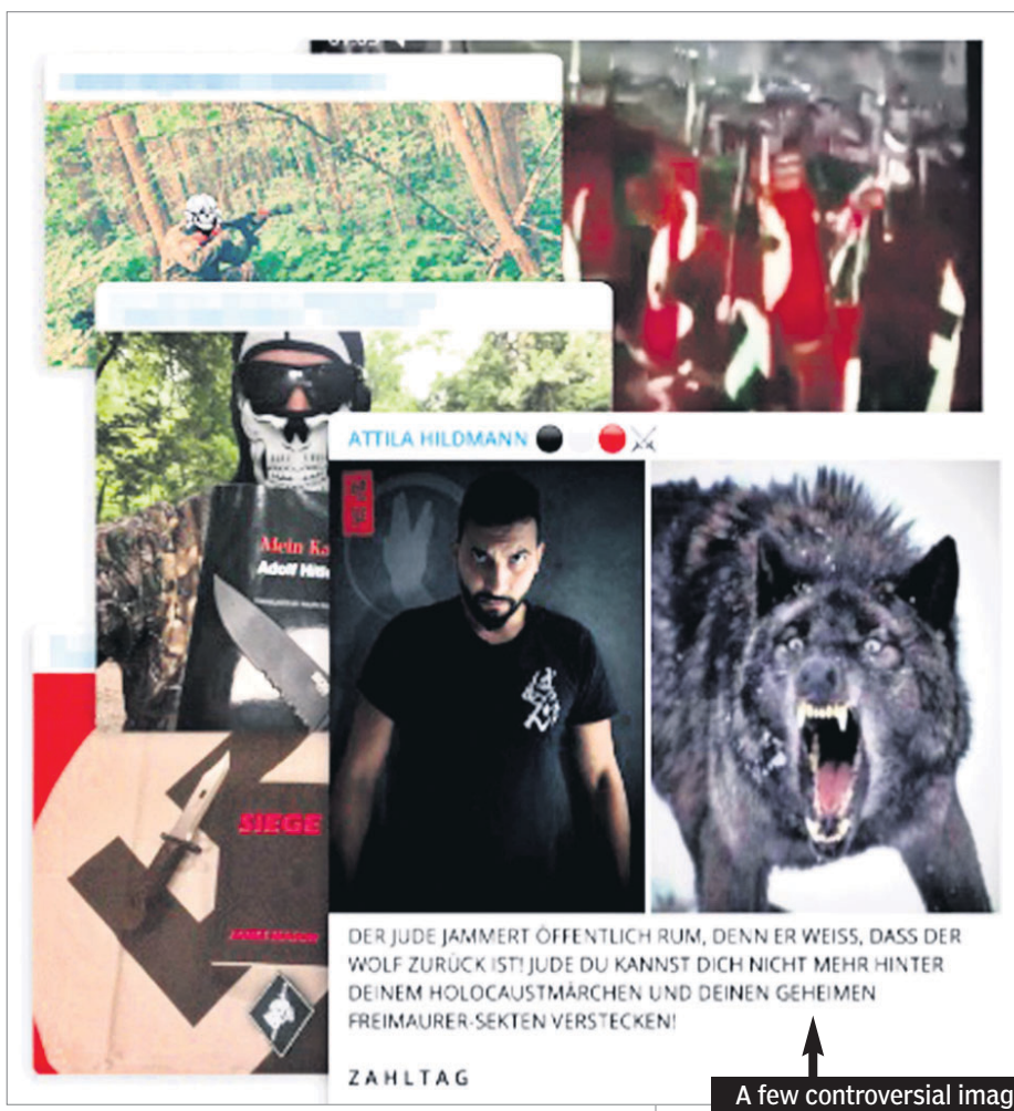
A few controversial images posted in Telegram