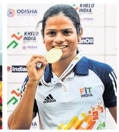
MOMENTS OF GLORY

According to Bharat, in the absence of a playground, one, willing to practice running has to choose between the uneven village road and the Chennai-Kolkata National Highway-16, barely a kilometer away. While it's literally not possible to even jog casually on the village road, the highway is unsafe. However, if one tried, on either of them, not success, but an accident, is assured.