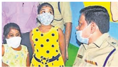
friendly police stations.

In 2017, the National Commission for Protection of Child Rights (NCPCR) had released a guideline enumerating the details regarding required infrastructure, official set up for establishment of child-