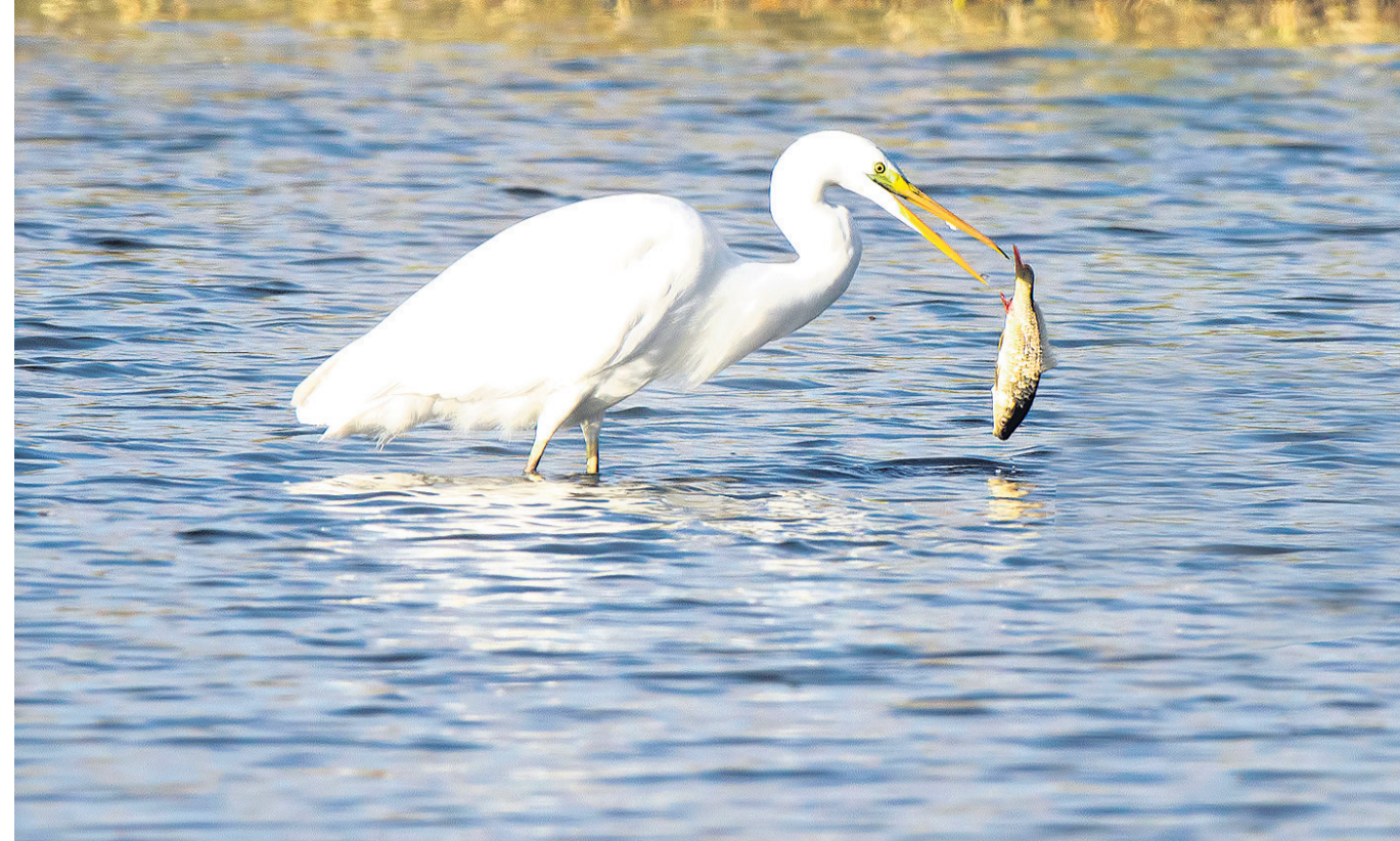
An egret catches a fish in Mogan Lake in Ankara