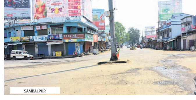
Sambalpur: lance, fire brigade, milk vans and medicine shops were kept outside the bandh purview. Police had arrested Gobinda Sahu, the prime accused, from a sugarcane field at Budhipadar village under Bangomunda block October 19.

Barpali observed the bandh from 6:00 am to 12:00 pm. During the six hours, vehicles remained off the road and markets and business establishments downed their shutters. Essential services like ambu-