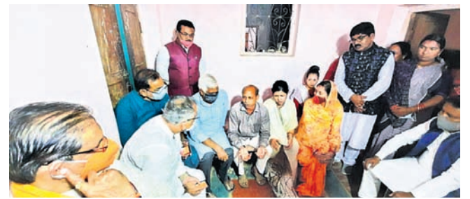
same, the BJP team met the deceased teacher's family members. Notably, a four-member team of