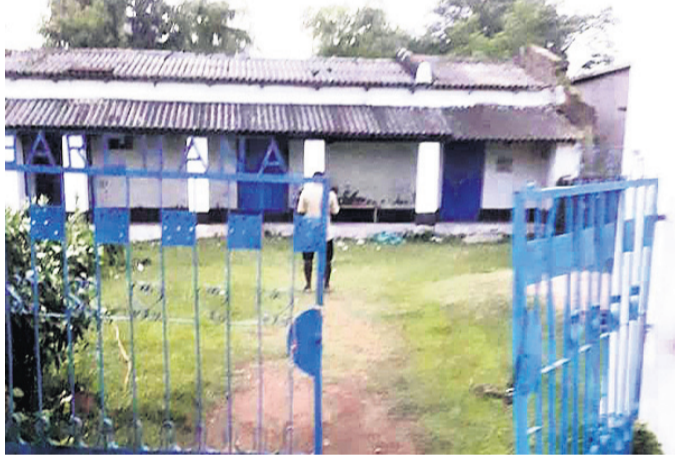
The affected farmers had taken up the issue with the Minister for Food Supplies and Consumer Welfare and Cooperation and other concerned officials, July 16, 2021