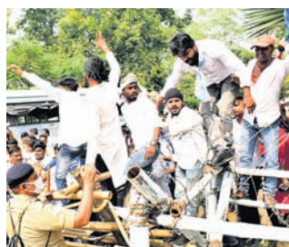
NSUI activists during a demonstration in Bhubaneswar, Tuesday