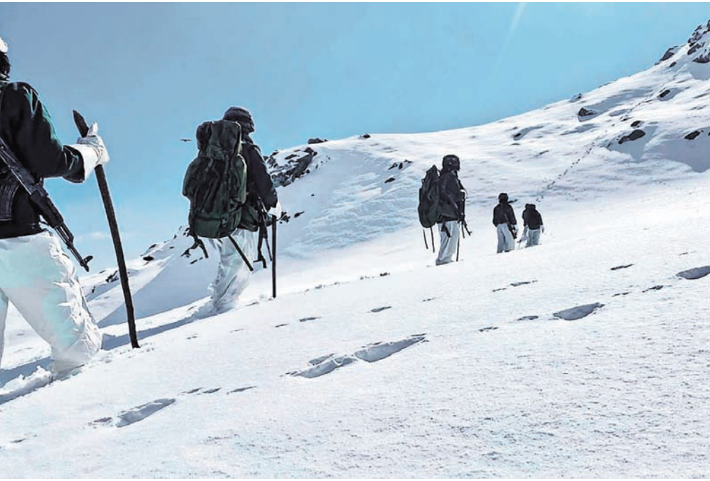
Indian Army and J&K Police personnel during a rescue operation for two missing villagers in the upper snow clad reaches of Rajouri district, Tuesday