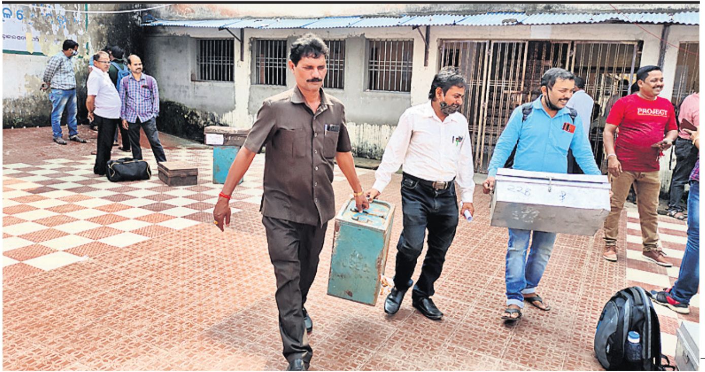
Polling officials leaving for booths on the eve of a by-election for the post of sarpanch in Mahakalpara panchayat of Kendrapara district, Tuesday