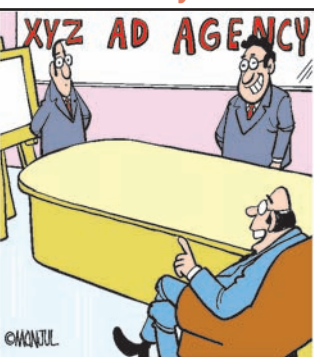
Budget is not an issue. Give me an ad which can be withdrawn soon after its release