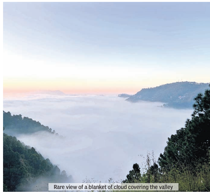
Rare view of a blanket of cloud covering the valley

Chail can be recommended to the newlyweds