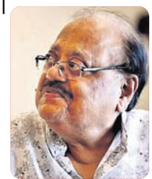
For me, rain is my much-admired beloved as well as a revered goddess who fills my heart and soul. To not hurt 'rain' - my eternal beloved, I couldn't love the spring and its graceful aura

His Sania and Manika of Shesha Shravana also chose rain as a catalyst to express their love for each other