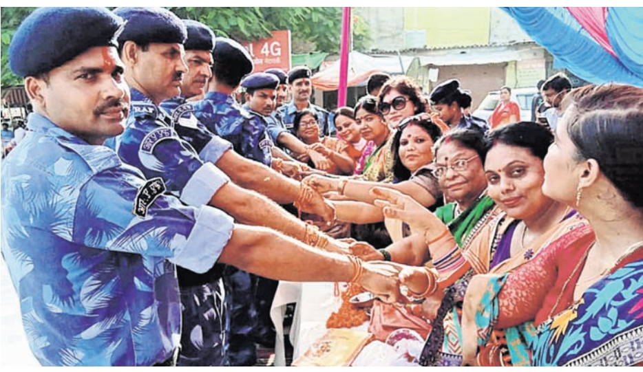
Women tying rakhis to BSF jawans in Rajasthan

Being aware of Indian tradition and culture, she sent a rakhi to Porus asking him not to hurt her husband on the battlefield. During the battle of the banks of River Jhelum, which is called Hydaspes by the Greeks, Porus saw the rakhi on his wrist. This reminded him of Roxana's request. He then stopped himself from attacking Alexander. Though Porus lost the battle, he won Alexander's respect and honor. Alexander reinstated Porus as a governor of his own kingdom. He also allowed him to rule over last to the south-east of his kingdom