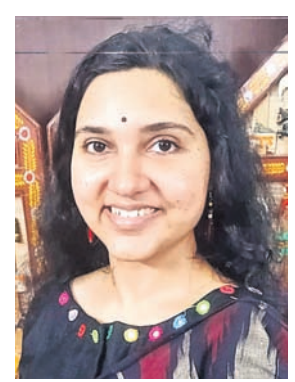
Actress Vidya Balan in an Amrita Sabat's creation

international exhibitions. We also built up our social media presence and launched the website www.utkalamrita.com."