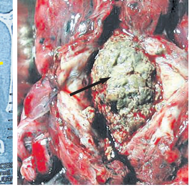
Green- coloured fungal ball in lung removed through surgery

body becomes weak. This facilitates an easy entry of Aspergillus germ into the lung. When this fungus makes the dead space of lung as its permanent address, it multiplies in thousands and creates a dense network in which blood products and destroyed portion of lung get trapped and ultimately the whole thing appears like a ball, which on chest x-ray resemble a white cricket ball. If one looks at the chest xray of such patient, it appears as if a white coloured ball is lying in a dark hollow area. This white ball is called in medical terms as 'Fungal ball' meaning thereby a ball made up