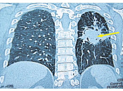
CT scan of chest showing aspergilloma in left lung

are responsible for creating hollow cavities inside the lung. Besides these, the cancer of lung, disease of sarcoidosis and histoplasmosis also lead to dead hollow spaces inside the lung. These hollow cavities become the favourite spot for 'Aspergillus' fungus to stay and thus after sometimes this fungus makes a solid fibre ball of threads. Apart from this, the blood pipes adjacent to these hol-