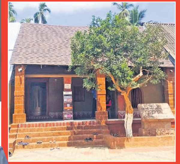
The house where Utkalamani was born