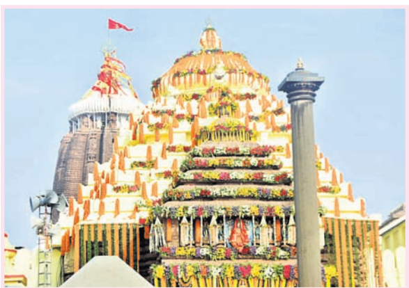
Srimandir adorned with flowers