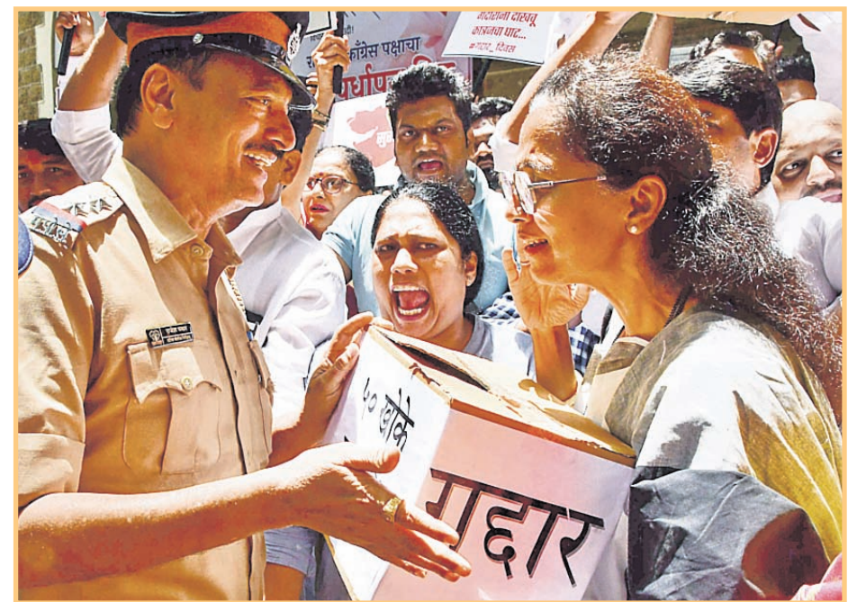
Nationalist Congress Party (NCP) working president Supriya Sule along with party workers protest to mark the anniversary (Gaddar Day) of then Shiv Sena leader Eknath Shinde's rebellion against the party that resulted in the fall of the Maha Vikas Aghadi (MVA) government, outside NCP office in Mumbai