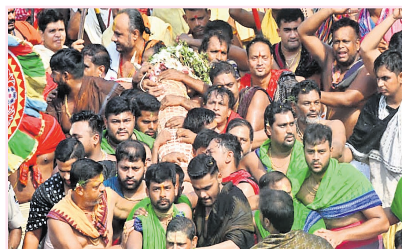
Lord Balabhadra, Devi Subhadra, Lord Jagannath and Lord Sudarshan being carried to the chariots from the sanctum sanctorum of Srimandir through Pahandi procession