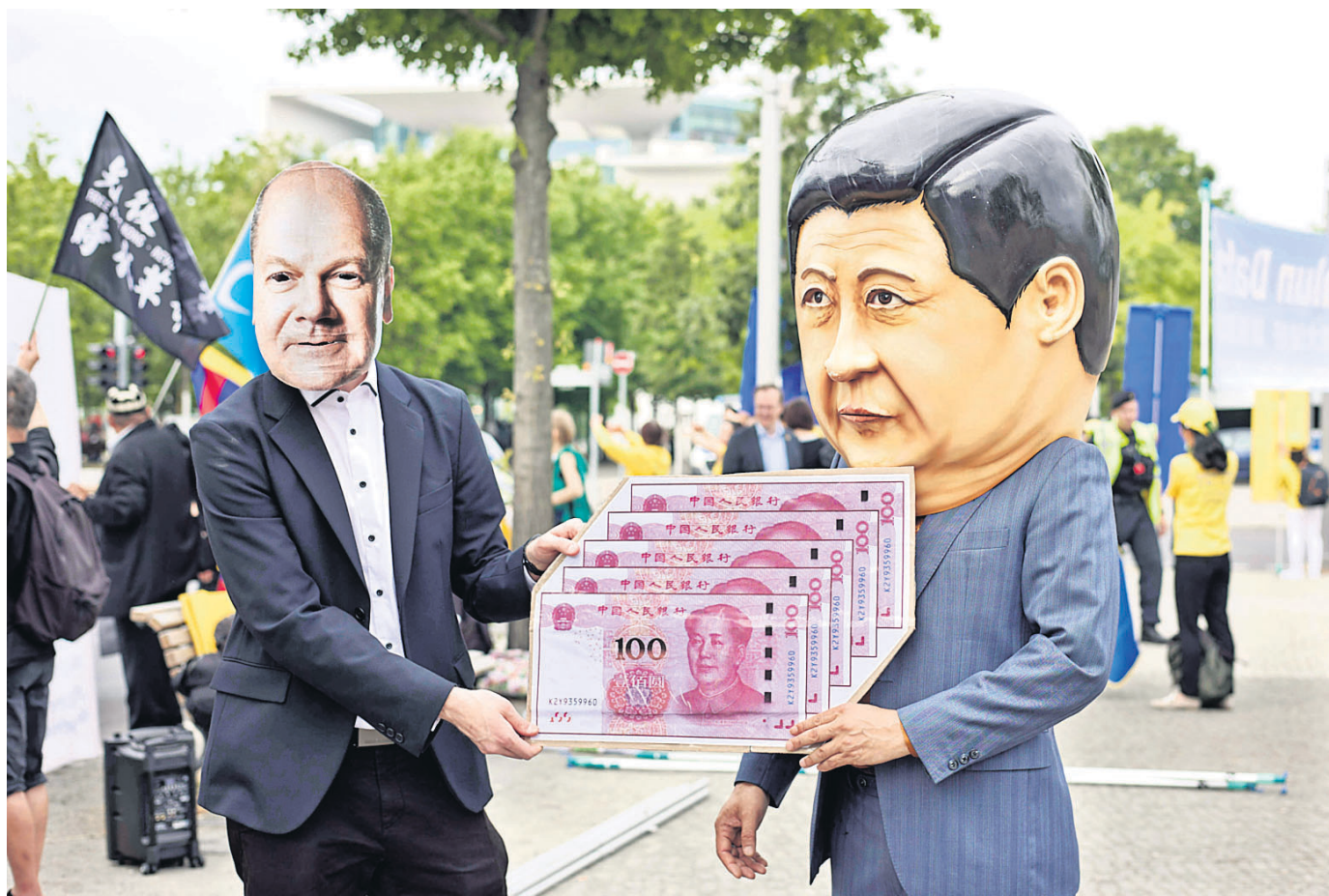
Demonstrators wear masks depicting German Chancellor Olaf Scholz, left, and Chinese President Xi Jinping during a protest in front of the Federal Chancellery against the human rights situation in China on the occasion of the German-Chinese government consultations, in Berlin, Germany