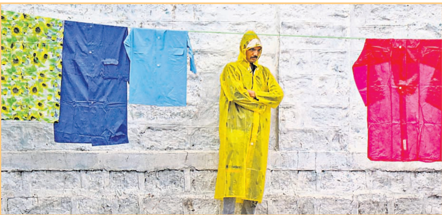
A vendor sells rain jackets on a rainy day at Mysore road in Bangalore