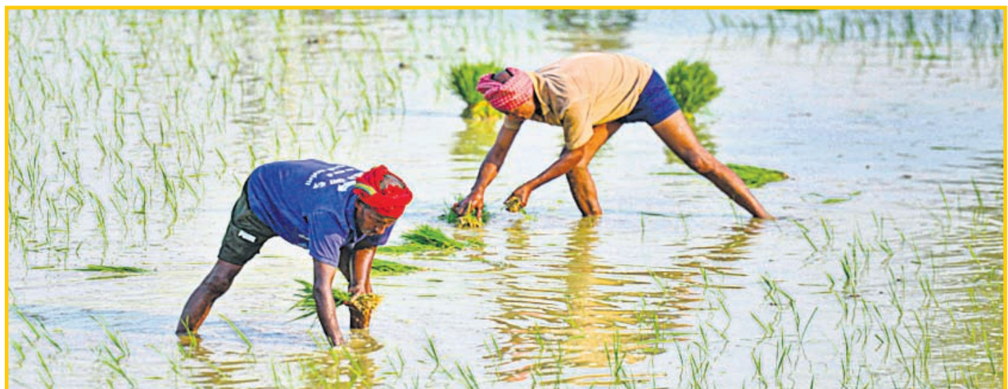
Farm labourers plants paddy saplings in Jalandhar