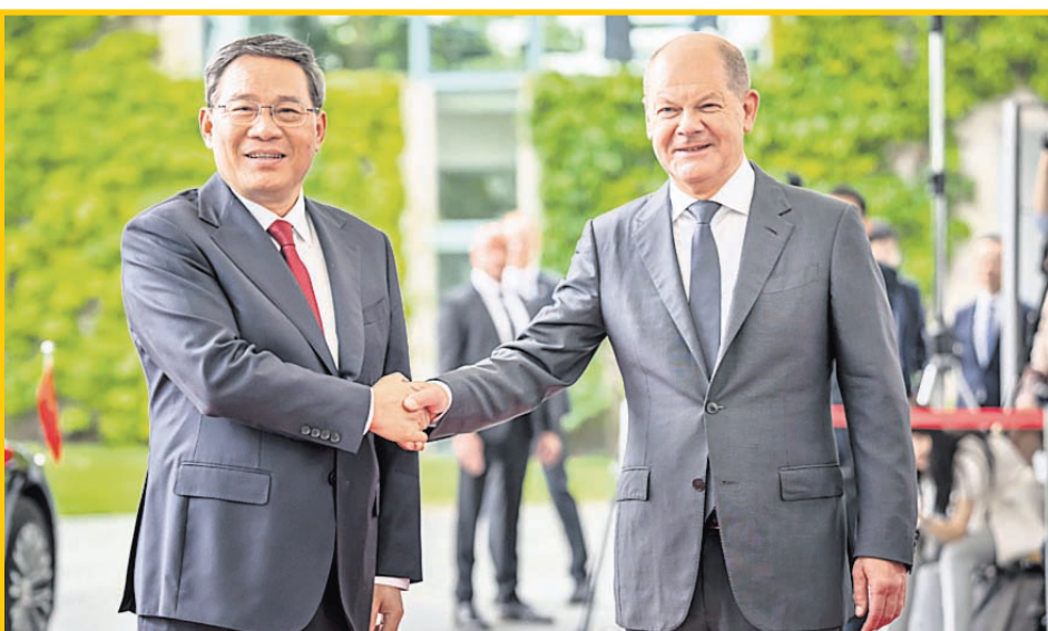
German Chancellor Olaf Scholz, right, greets Chinese Premier Li Qiang in front of the Federal Chancellery before the reception with military honors for the German-Chinese government consultations in Berlin, Germany