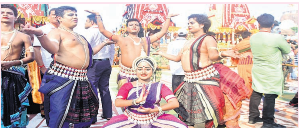
Artistes performing in front of Srimandir