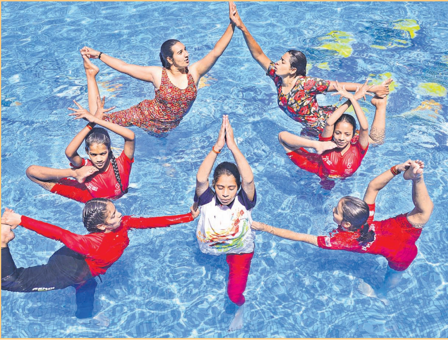
Students perform yoga at a swimming pool on the eve of International Yoga Day in Jabalpur