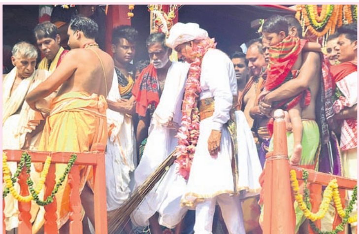
Gajapati Dibyasingh Deb performing Chhera Panhara on a chariot