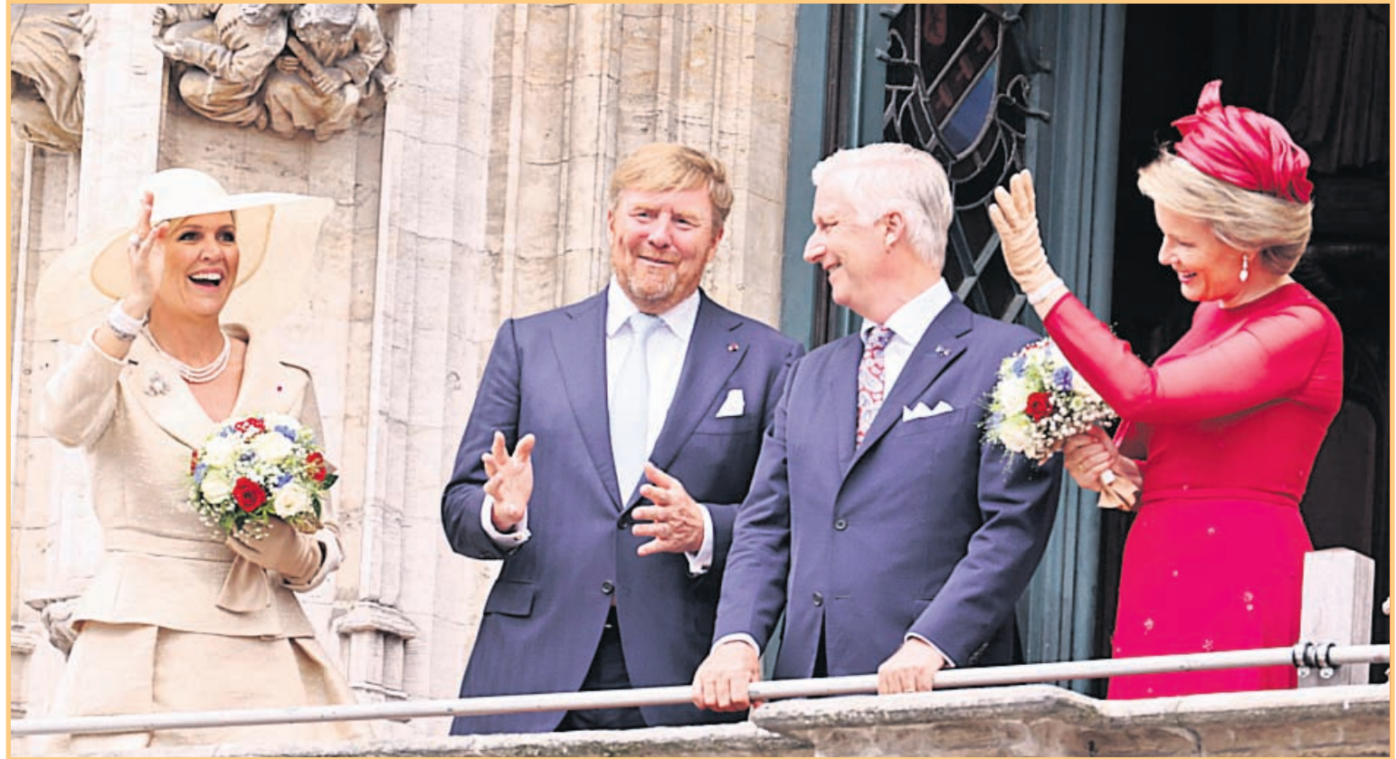
Dutch Queen Maxima and King Willem Alexander, left, and Belgium's King Philippe and Queen Mathilde wave to the crowd from the balcony of the Grand Place in Brussels, as part of the activities of the Dutch Royals state visit to Belgium. The Dutch royals are on a three-day visit to Belgium