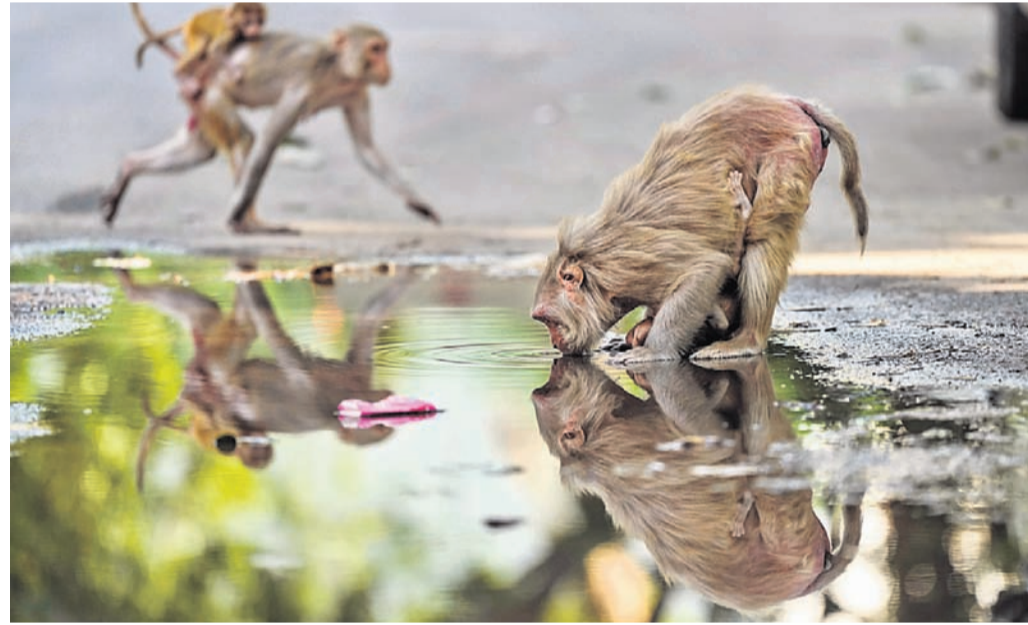
BEATING THE HEAT: A monkey drinks water from a waterlogged street on a hot day in New Delhi

New Delhi: The Supreme Court Tuesday refused to hear the interlocutory application (IA) filed by the Manipur Tribal Forum alleging that even after the Centre's assurances to this court, 70 tribals were killed in violence in the state.