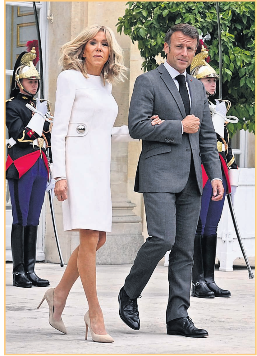
French President Emmanuel Macron and his wife Brigitte Macron wait for South Korean President Yoon Suk Yeol and his wife Kim Keon Hee before a working lunch at the Elysee Palace in Paris