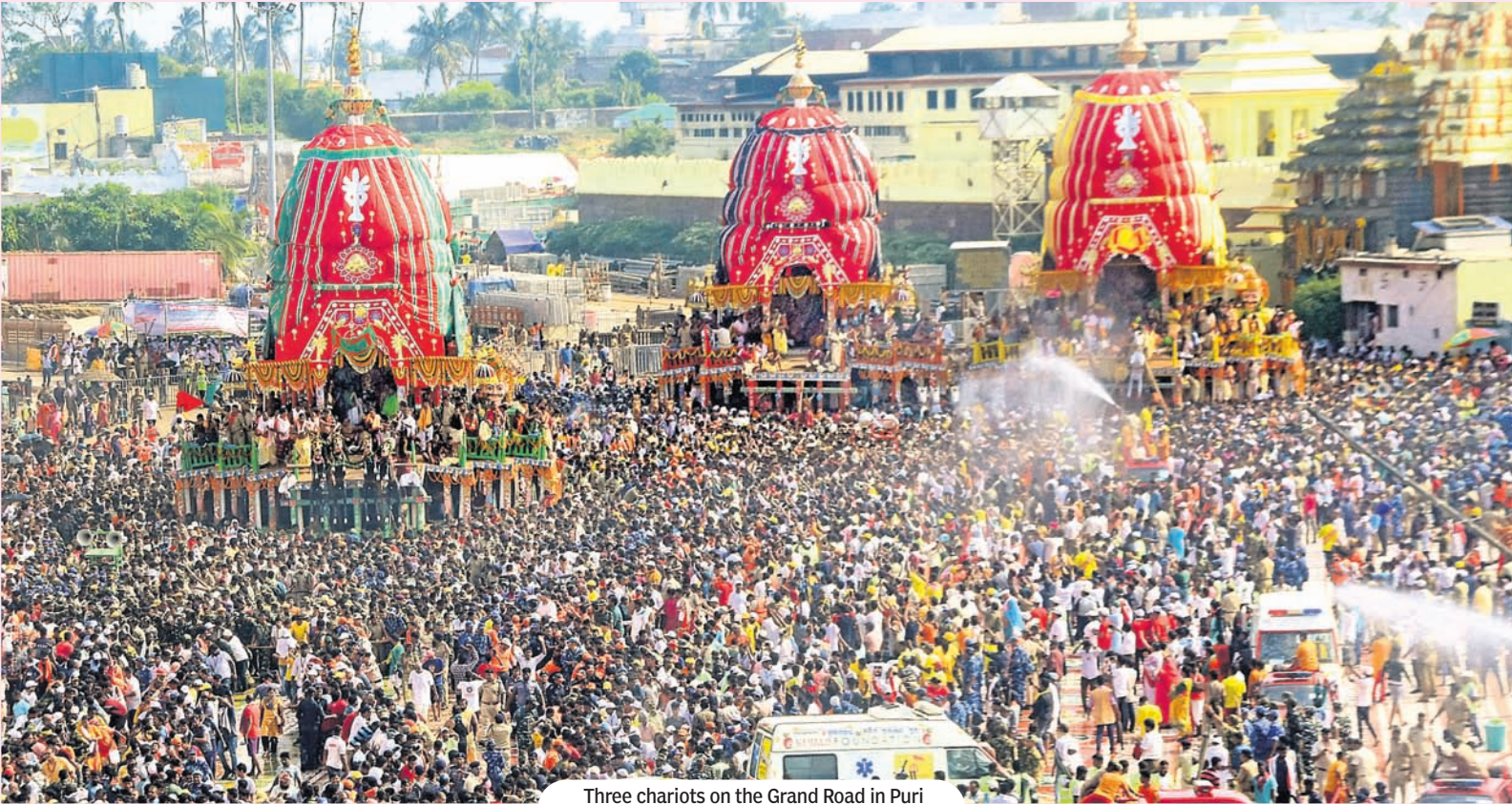
Three chariots on the Grand Road in Puri