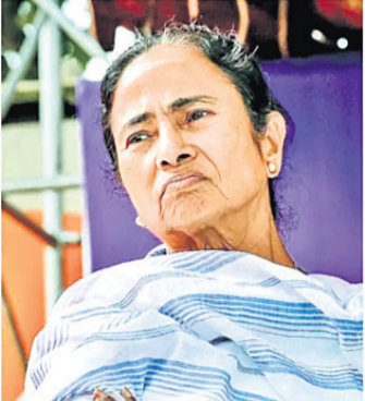
THE APEX COURT OBSERVED THE TENOR OF THE HIGH COURT ORDER WAS TO ENSURE FREE AND FAIR ELECTION IN THE STATE