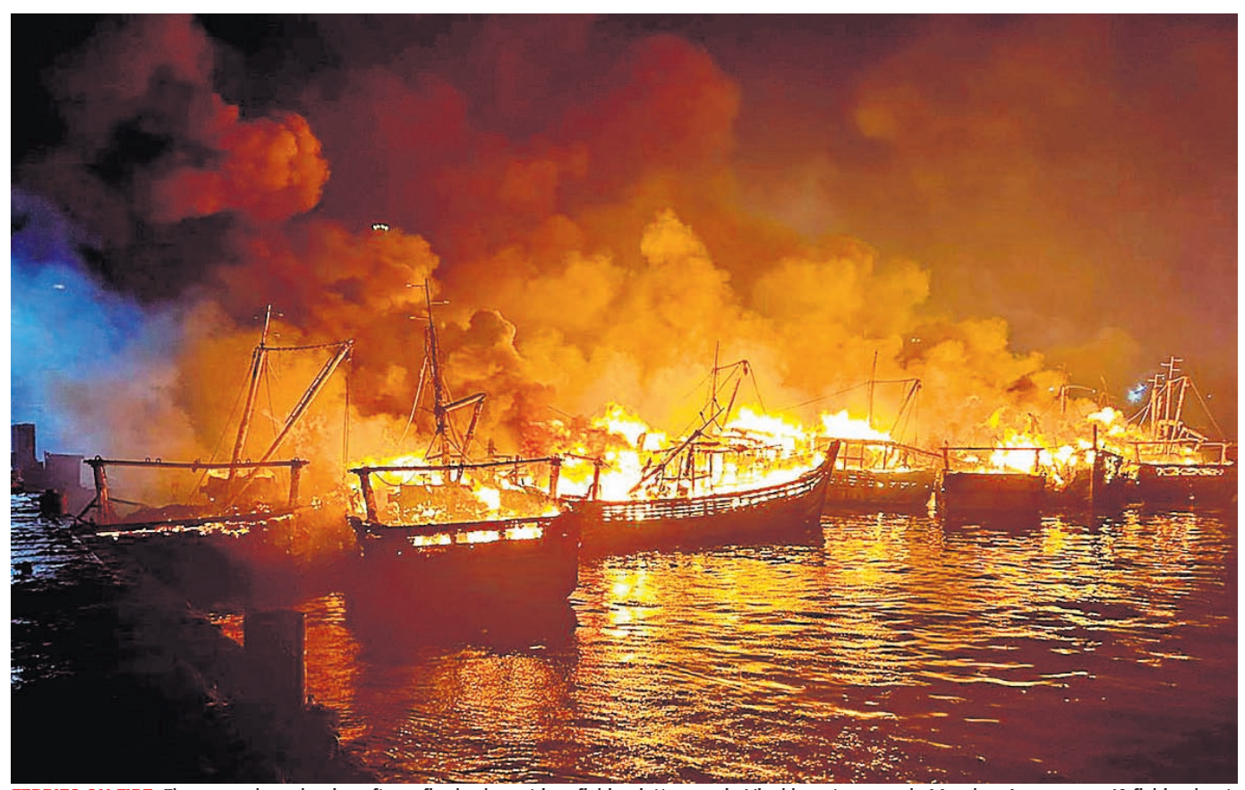
FERRIES ON FIRE: Flames and smoke rise after a fire broke out in a fishing jetty area in Visakhapatnam early Monday. As many as 40 fishing boats were reportedly gutted in the blaze