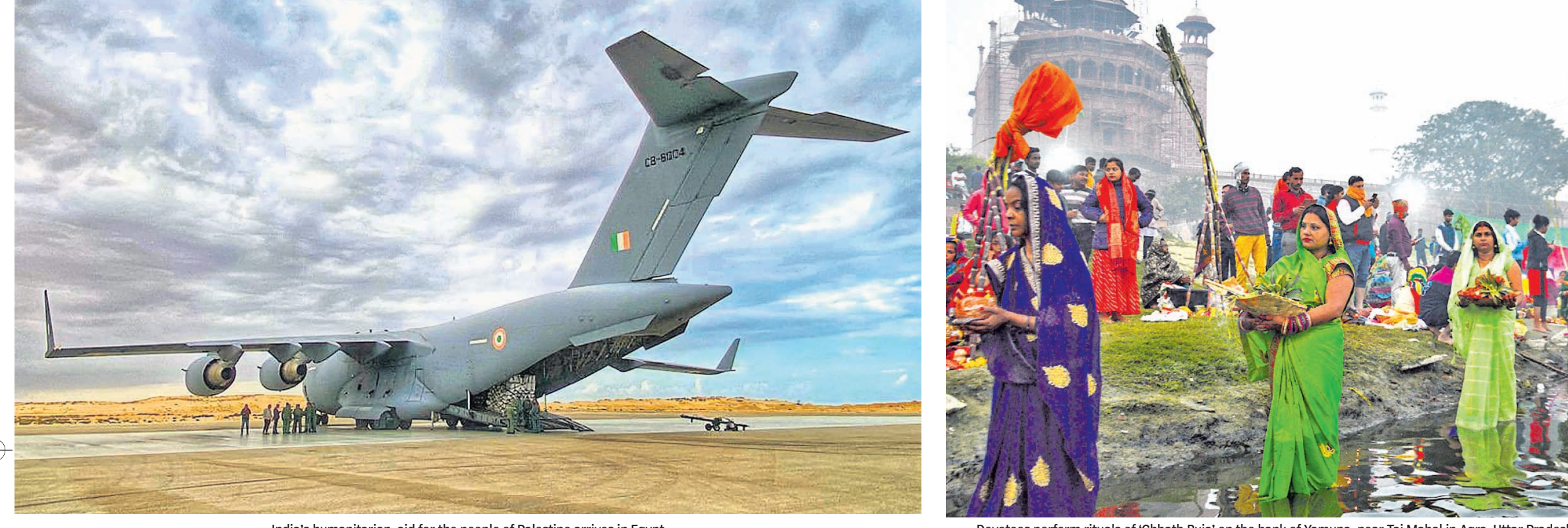
India's humanitarian aid for the people of Palestine arrives in Egypt