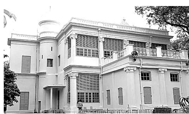
A bit of history missing, a founder's name left out on a commemorative pillar or plaque, names and eras left out of textbooks are not uncommon now

West Bengal Chief Minister Mamata Baneriee has alleged that Amartya Sen is being harassed for his criticism of BJP's policies. Whether that is the case or not the controversy sub-