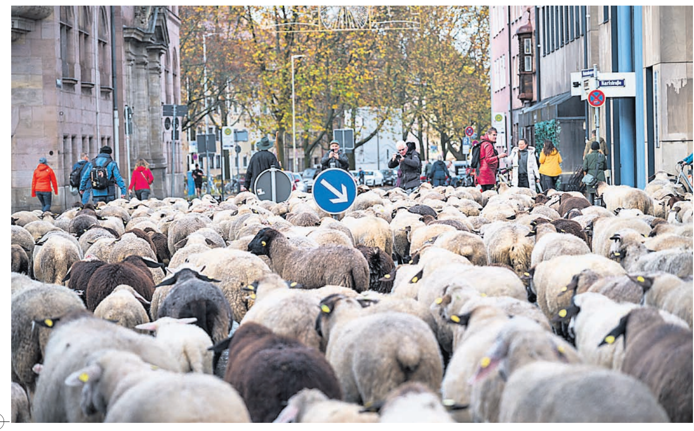
600 sheep are moved through Nuremberg's city center to reach their winter quarters west of the city from the Pegnitz Valley, Germany