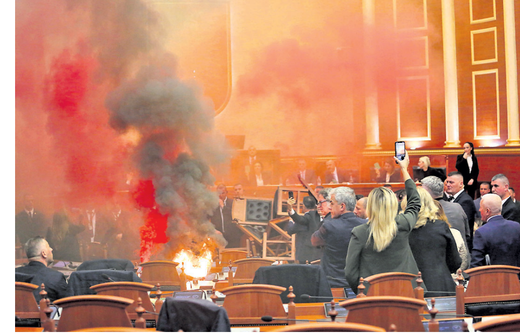
Democratic lawmakers throw flares during a parliament session in Tirana, Albania, Monday. Albanian opposition lawmakers disrupted the Parliament's session again Monday to protest against what they say is increasingly authoritarian rule by the governing Socialists

In the south, where hundreds of thousands of Gazans who fled the north of the enclave are sheltering, at least 14 Palestinians were killed in two Israeli strikes on houses in Rafah, according to Gaza health authorities