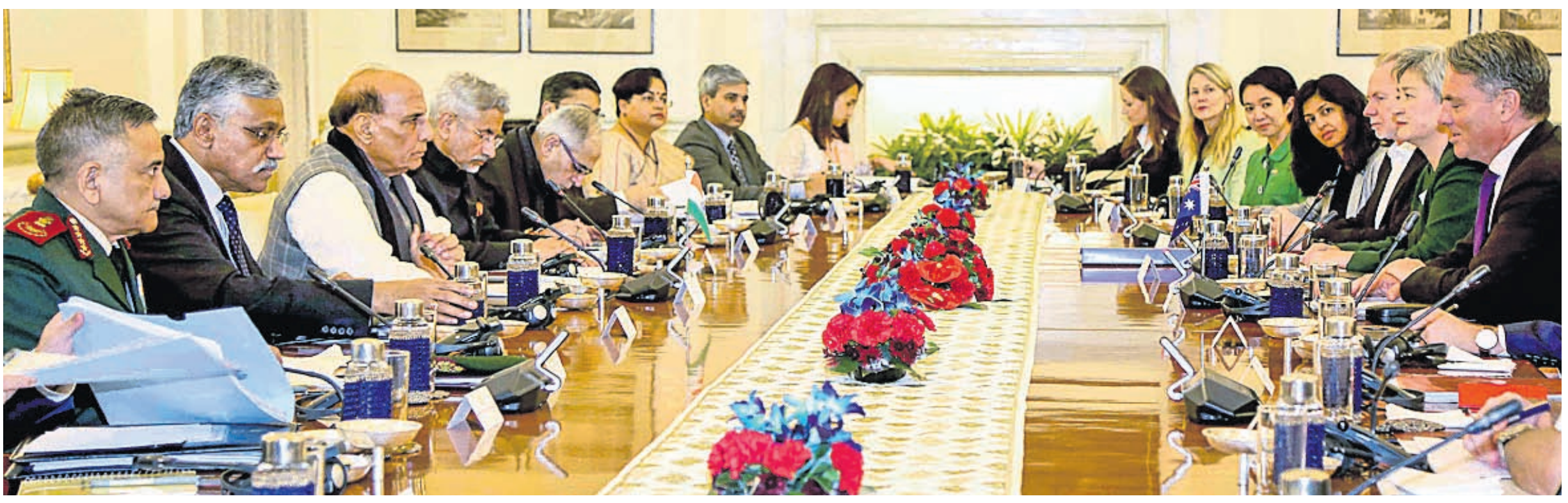
Defence Minister Rajnath Singh and External Affairs Minister S Jaishankar with Australian Deputy Prime Minister and Defence Minister Richard Marles and Foreign Affairs Minister Penny Wong during the 2nd India-Australia 2+2 Ministerial Dialogue, in New Delhi. India and Australia decided to further strengthen their strategic partnership to deal with "exceptional challenges" in the Indo-Pacific region and across the globe, with special focus on defence cooperation