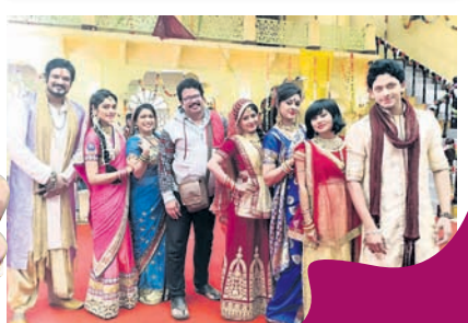
On the set of Nua Bohu with the artistes

ne of the things I do on a holiday is catching up with family members. My vounger brother, his wife, my niece, and others visit my sister's resort and have a fantastic time.