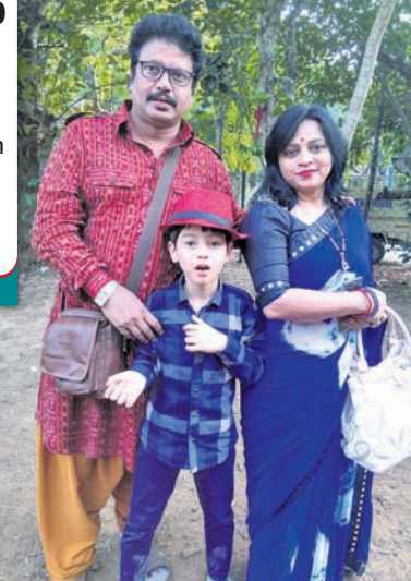
With wife and son

On a holiday, my son and I enjoy an extended sleep since he comes into my bed early in the morning to snuggle under the cover. An extra hour of napping with him helps me beat exhaustion and start the day afresh.