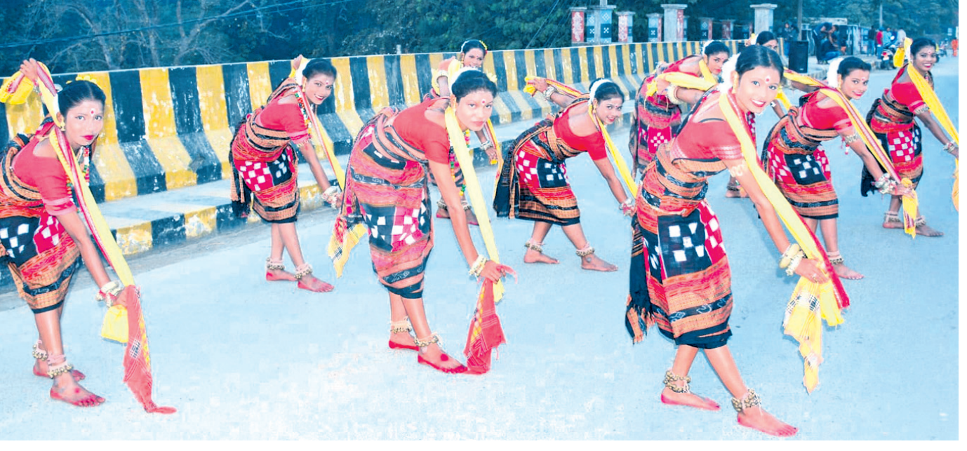
MATTER OF PRIDE: Artistes of Tribal Folk and Art Centre rehearsing a Sambalpuri dance routine on Kacheri Road in Sambalpur, Sunday before leaving for New Delhi to perform on Kartavya Path during the Republic Day

the district administration, The report also states that 414 persons were killed in 831 road accidents in 2022 while 377 perpeople will die.