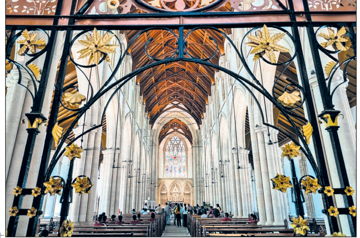
View of the newly-restored Afghan War Memorial Church, in Mumbai