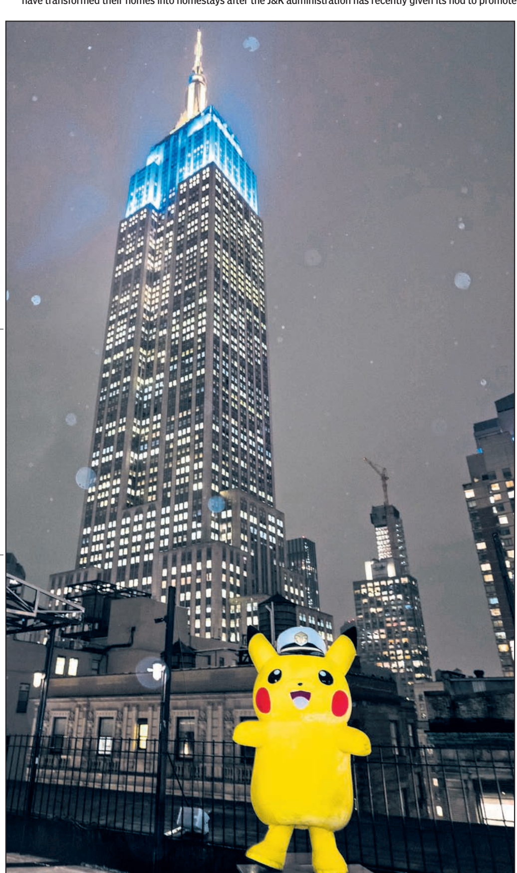
Captain Pikachu, one of the stars of 'Pokémon Horizons: The Series', proudly posed with the Empire State Building's world-famous tower lights as they shined bright for Pokémon Day 2024