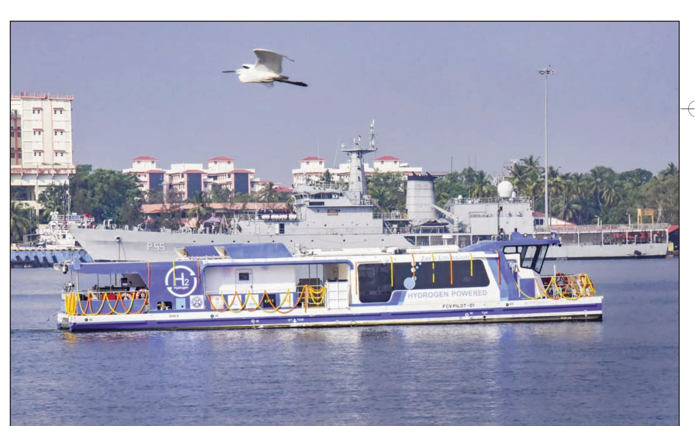
India's first indigenous green hydrogen waterway vessel built by Cochin Shipyard, at the backwaters of Kochi