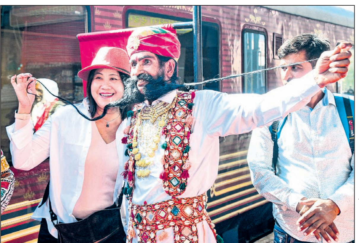
A local artist with long mustache poses for photos with a tourist after the arrival of Maharajas Express train, in Bikaner