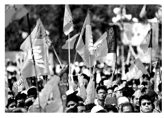
In this big ensuing electoral battle, it remains to be seen whether Modi's experiment of a sharper thrust on religion will get him the massive majority that he claims to be heading towards and drastically change politics in the country

At same time, it's evident that BJP is seeking to win back its old allies. The Bihar effect is being felt in other places as in Punjab and West Bengal, where the ruling AAP and TMC have decided to go it alone respectively. Much depends on what happens in Maharashtra and