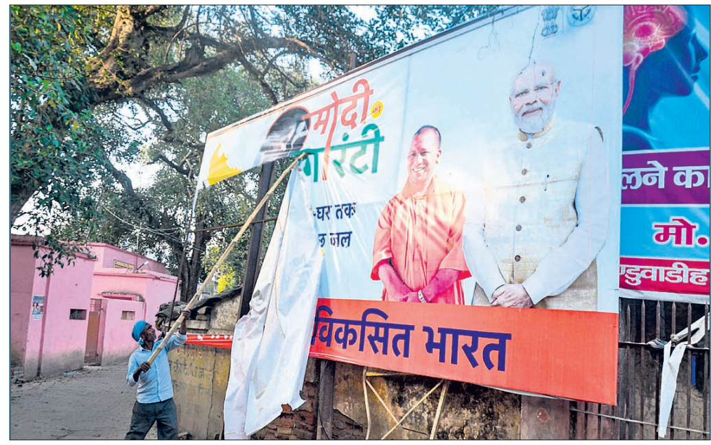
A worker removes posters of political leaders after the Model Code of Conduct was enforced following announcement of the schedule of Lok Sabha elections, in Mirzapur, Saturday.

The National Democratic Alliance (NDA) coalition is much the same in 2024 as it was in 2019. The NDA allies then included Apna Dal and Suheldev Bhartiva Samai Party. It has now included the Nishad party as well into its fold. The major difference is that in 2019, the state witnessed a threeway contest with the Samajwadi Party (SP) and Bahujan Samaj Party (BSP) combined pitted