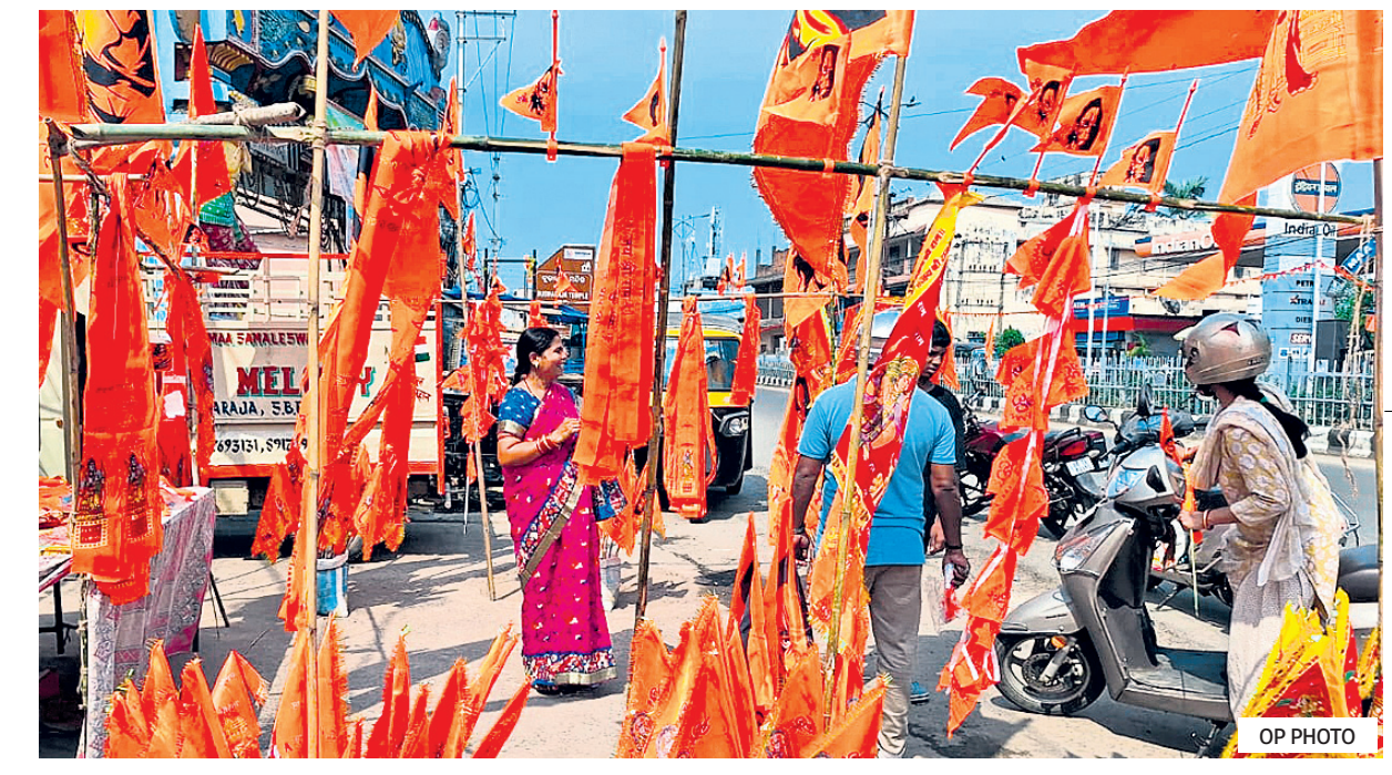
UP FOR SALE: Vendors display flags bearing images of Lord Hanuman for sale on the eve of Hanuman Jayanti in Sambalpur, Saturday