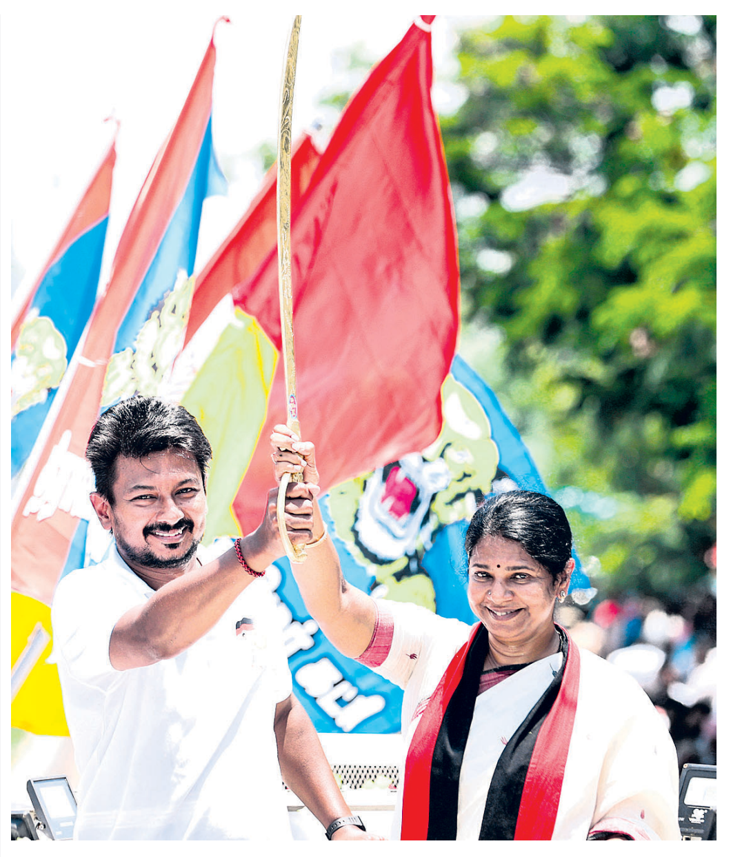
Tamil Nadu minister and DMK leader Udhayanidhi Stalin with party's candidate from Thoothukudi constituency Kanimozhi Karunanidhi during an election campaign ahead of the Lok Sabha polls, in Thoothukudi district, Saturday

Elections for the 175-member Assembly and 25 Lok Sabha seats in Andhra Pradesh are scheduled May 13 and the counting of votes is slated for June 4.