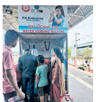
ARINDAM GANGULY, OP

Bhubaneswar, April 13: In view of imminent scorching summer, the Ministry of Railways (MoR) reviewed the availability of drinking water at stations and issued instructions to Zonal Railways to ensure adequate supplies. As per the MoR's ongoing commitment, all stations strive to provide clean drinking water to passengers in accordance with established norms.