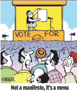
us. What we should eat, what we shouldn't