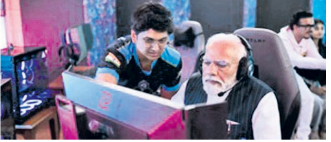
PRESS TRUST OF INDIA

New Delhi, April 13: The gaming industry does not require any regulation, Prime Minister Narendra Modi said Saturday while asserting that it must remain free and only then it will boom.