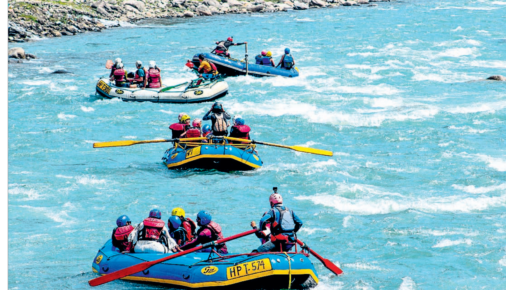
ADVENTURE FREAKS: Tourists participate in river rafting in Manali, Saturday