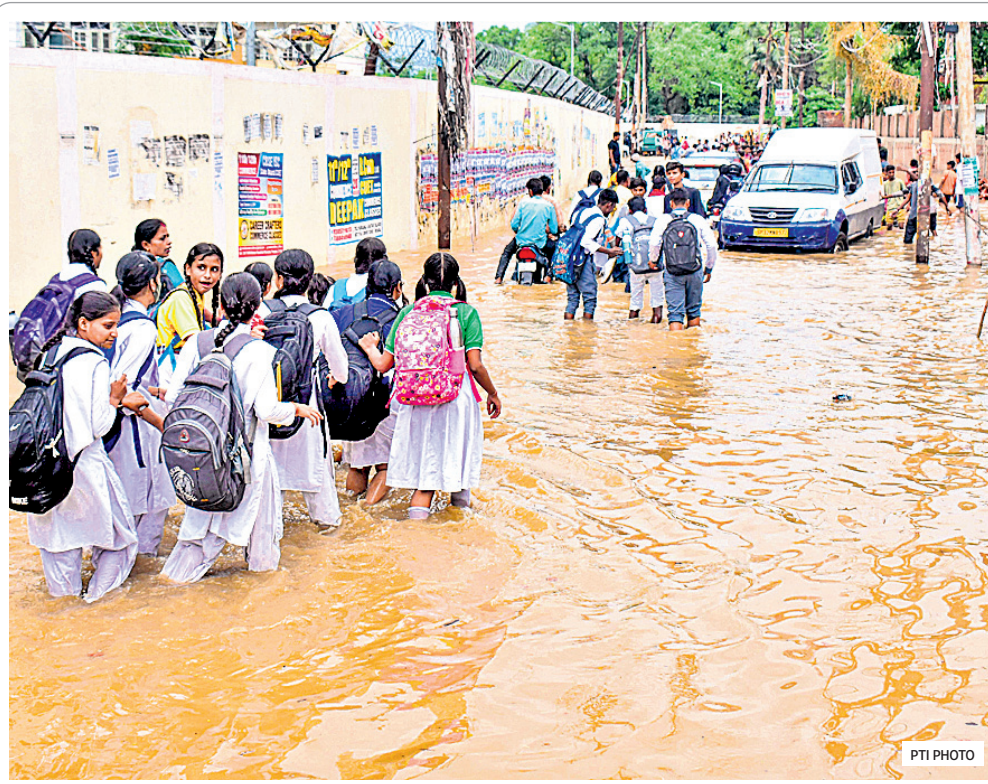
School students wade through a waterlogged road following heavy monsoon rains, in Prayagraj, Wednesday

The impacted banks account for less than 1 per cent of the overall payment system volume in the country, the official stressed.