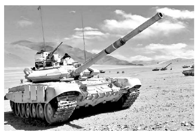
Though the Ministry target of 70% self-reliance in weaponry by 2027 may be difficult to achieve, huge prospects are being created for industry players

India plans to achieve the milestone of ₹3 lakh crore in defence manufacturing and ₹30,000 crore of defence exports by 2028-29. The planned modernisation of Su-30MKI fighter fleet along with additional procurement of aircraft, acquisition of engines for the existing MiG-29 fleet and purchase of