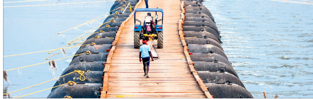
A pontoon bridge being made ahead of the 'Maha Kumbh Mela', at the Sangam, the confluence of three rivers the Ganga, Yamuna and mythical Saraswati in Prayagraj, Uttar Pradesh

The top court August 2 said it couldn't order holding of the NEET-UG 24 afresh as no sufficient material on its record indicated a systemic leak or malpractice, compromising the integrity of the examination.