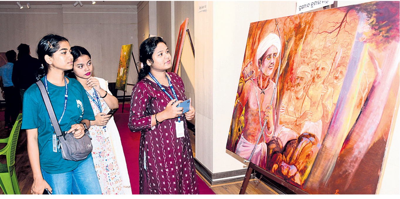
ARTISTIC CREATION: Girls look at an artwork on the concluding day of a state-level workshop organised by Bibhuti Kanungo College of Art & Crafts and Scheduled Castes and Scheduled Tribes Research and Training Institute in celebration of Bhagwan Birsa Munda on his 150th birth anniversary at Kalinga Art Gallery in Bhubaneswar, Wednesday

The buses are currently operating in Bhubaneswar, Cuttack, Khurda, Pipili, Puri Konark, Rourkela, Sambalpur, and Berhampur.'