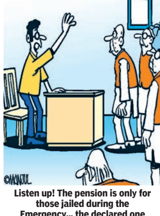
Listen up! The pension is only for those jailed during the Emergency... the declared one