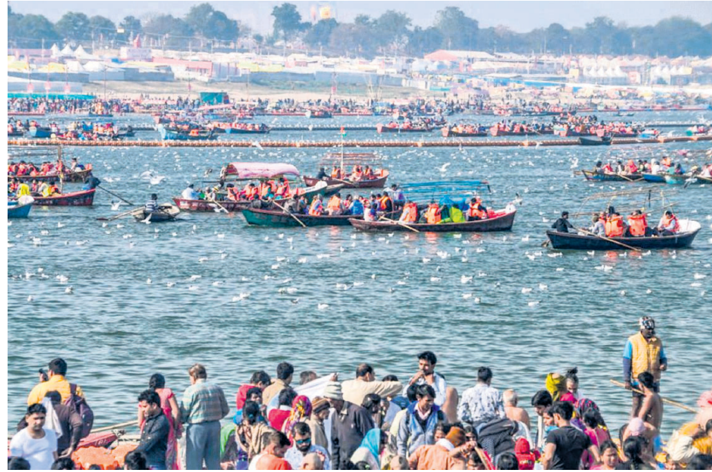
Devotees during the ongoing 'Maha Kumbh Mela' festival in Prayagraj, Uttar Pradesh

Fares are also trending higher for travel before key 'snan' dates. For example, fares for January 27 from key metros like Mumbai are going as high as ₹27,000 one-way for non-stop flights. Bookings for trains to Prayagraj have also jumped for the January 13 to February 26 period. The present edition of the Kumbh is being held after 12 years, though seers claim the celestial permutations and combinations for the event are taking place after 144 years, making the occasion even more auspicious.