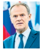
DONALD TUSK | PRIME MINISTER, POLAND

I will not go into details, I can only confirm the validity of fears that Russia was planning acts of air terror, not only against Poland, but against airlines around the world