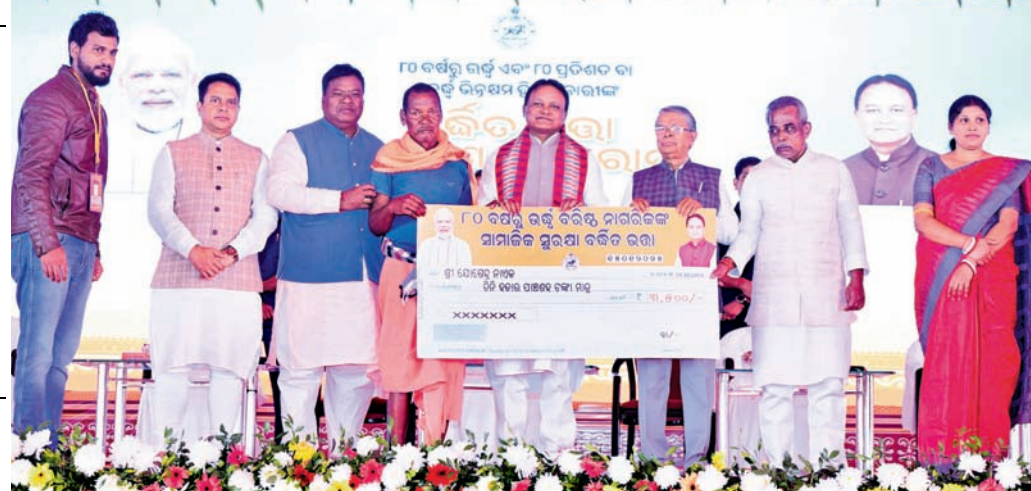
PNN & AGENCIES

Bhubaneswar, Jan 15: Chief Minister Mohan Charan Majhi Wednesday launched an enhanced social security pension scheme for individuals aged 80 years and above, and those with disability of 80 per cent or above.