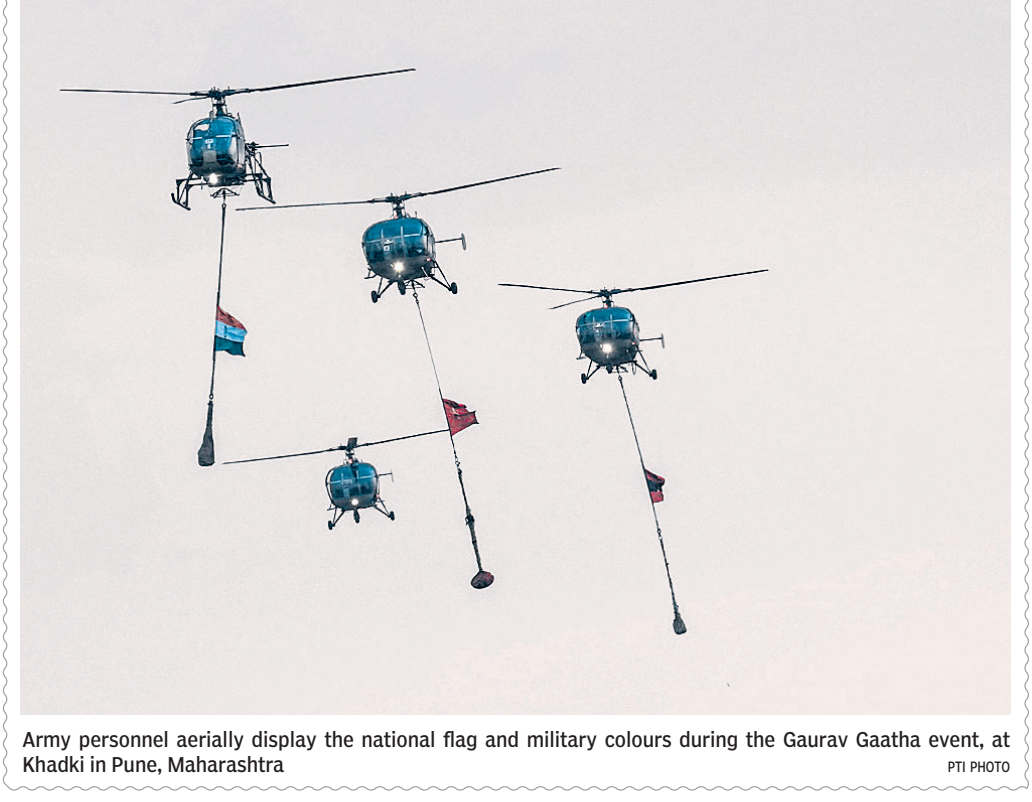
Army personnel aerially display the national flag and military colours during the Gaurav Gaatha event, at Khadki in Pune, Maharashtra

The senior lawyer urged the bench to ask the Election Commission of India (ECI) and the Centre to file their responses before the next date of hearing else they would come and say "reply is needed to be filed" on that day. "They will file the responses," the CJI said.