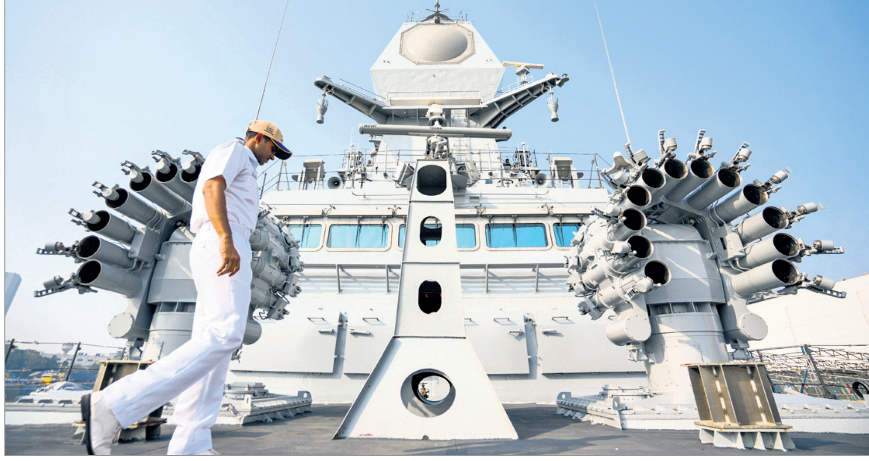
BOOSTING SECURITY: An Indian Navy personnel aboard INS Surat ahead of its commissioning ceremony, in Mumbai. INS Surat along with INS Nilgiri and INS Vagsheer was commissioned Wednesday at the Naval Dockyard in Mumbai in the presence of PM Narendra Modi (REPORT P9)