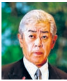
TAKESHI IWAYA | FOREIGN MINISTER, JAPAN

We will approach the next US administration to convey that constructive commitment of the United States in this region is important also for the United States itself