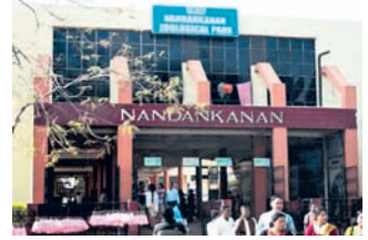
POST NEWS NETWORK

Barang, Jan 15: Tiger population at Nandankanan Zoological Park (NZP) here reduced to 27 as a white tiger cub died during treatment Wednesday. This apart, a doe (female deer) housed in the deer enclosure also died on the same day.