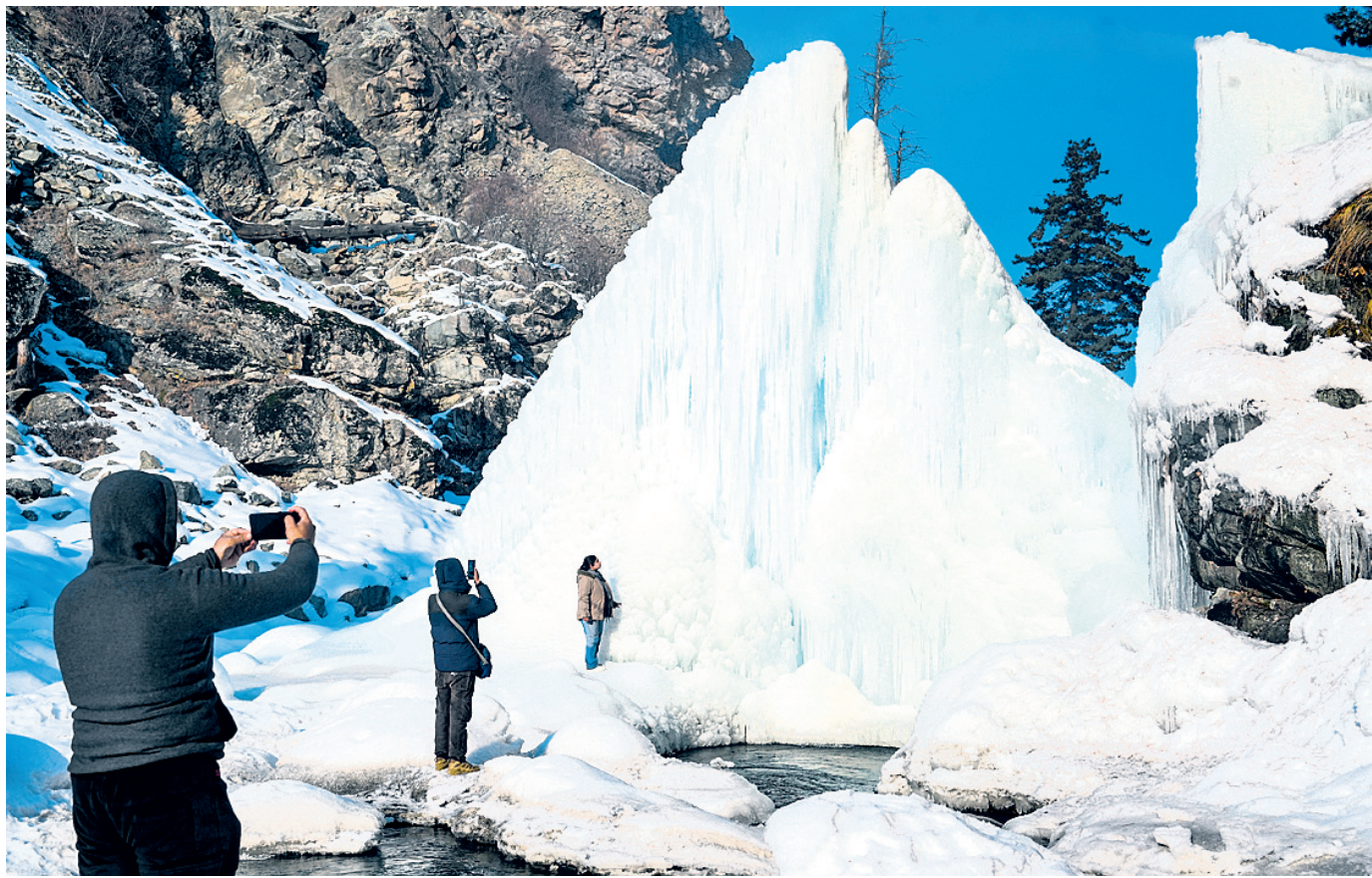
Tourists take pictures near icicles formed due to a water pipe leak at Tangmarg, in Baramulla district, Jammu and Kashmir