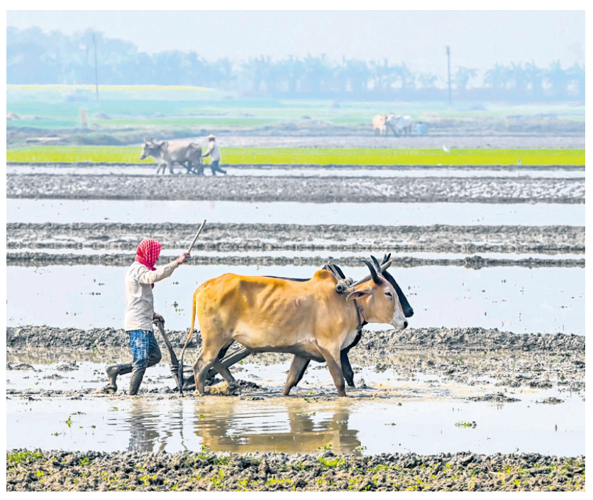
A farmer prepares an agricultural land for paddy cultivation, in Nadia district, West Bengal