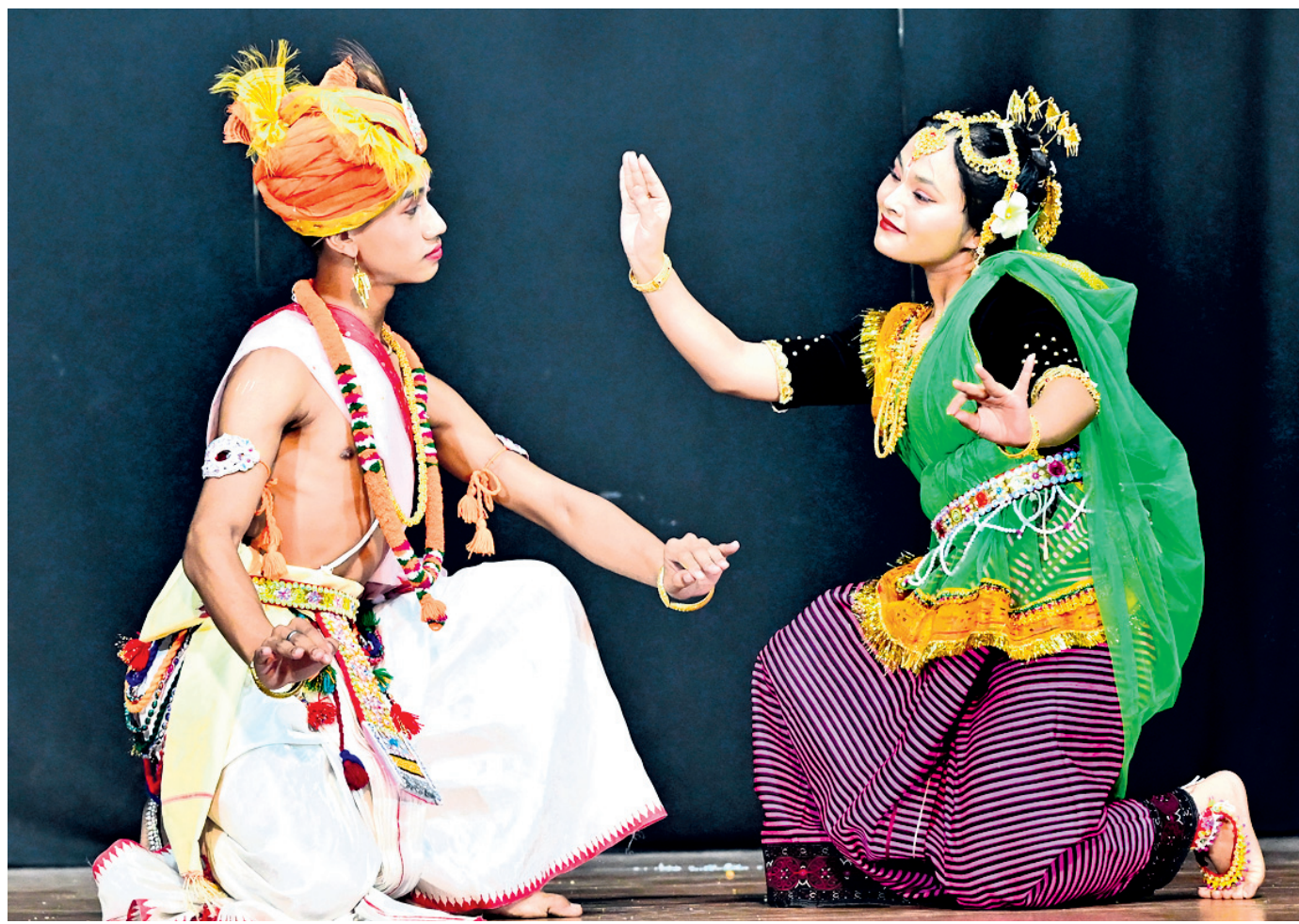
EXPRESSIONS: Artists from Film Academy Manipur perform Manipuri dance on the fourth evening of Global Theatre Festival, organised by Theatre Movement at Kala Vikash Kendra auditorium in Cuttack, Saturday

governance". The property cards were distributed among beneficiaries across more than 50,000 villages in 10 states -- Chhattisgarh, Gujarat, Himachal Pradesh, Madhya Pradesh, Maharashtra, Mizoram, Odisha, Punjab, Rajasthan, Uttar Pradesh and two Union territories of Jammu and Kashmir, and Ladakh. Modi said the scheme will help people get loans and benefits of other government schemes. Under the SVAMITVA scheme, which was launched in April 2020, a Record of Rights (RoR) was being provided to families owning houses in inhabited areas in villages. It will help in the monetisation of properties and enable institutional credit through bank loans, reducing property-related disputes, facilitating better assessment of properties and property tax in rural areas, and enabling comprehensive village-level planning.