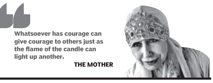
Whatever has courage can give courage to others just as the flame of the candle can light up another.

RECONCILIATION WITH EU IS UNLIKELY BUT POSSIBLE IN THE EVENT THAT RUSSIA FAILS TO MANAGE ITS ECONOMIC CRISIS