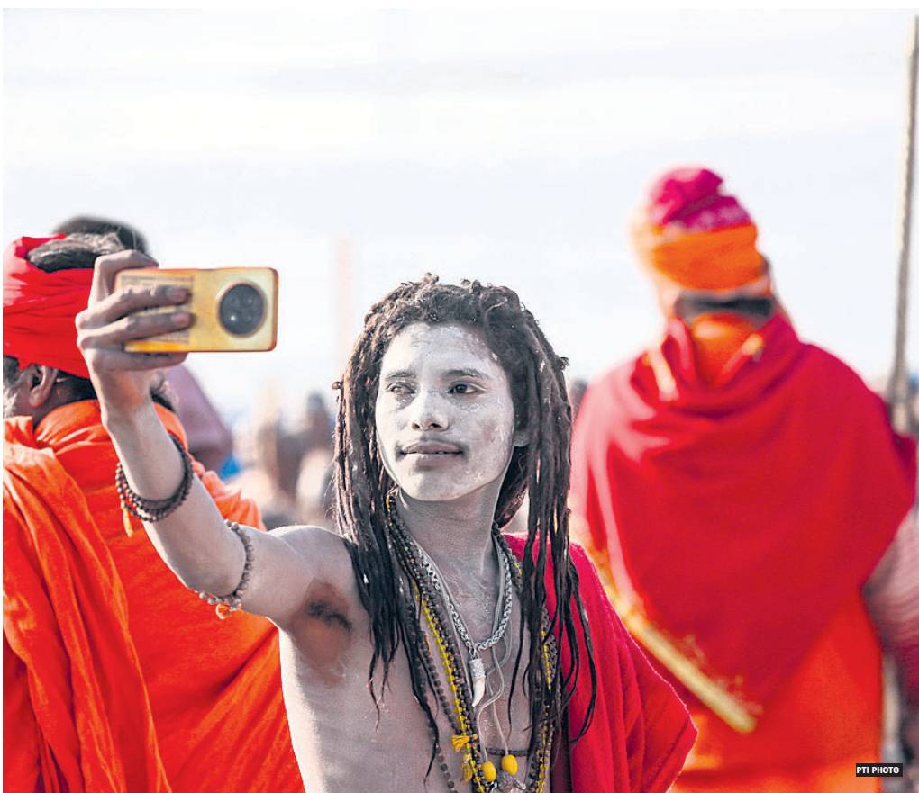
A 'Naga sadhu' clicks selfies at the Sangam area during the Maha Kumbh Mela 2025 in Prayagraj, Uttar Pradesh

In a statement, the paramilitary force said, "The situation was immediately brought under control following timely intervention by BSF and BGB personnel. Farmers from both sides were dispersed and sent back to their respective territories. There have been no reports of injuries in the incident."