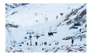
ure remains unknown. The ski resort's manage-

"It's like a cable has come off, the chairs have bounced and people have been thrown off," a witness told TVE. The cause of the cable fail-