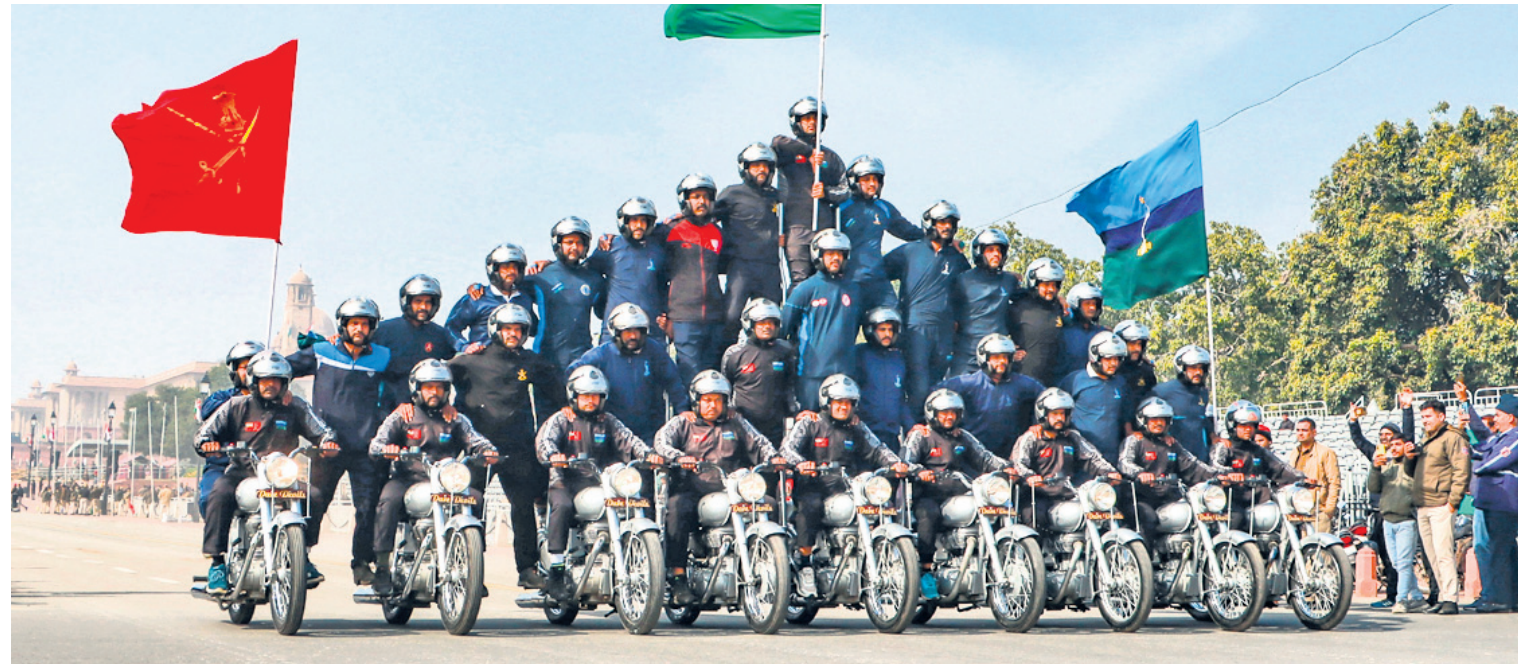
SKILLS ON DISPLAY: Security personnel during rehearsals for the Republic Day parade, at Kartavya Path in New Delhi, Saturday

Squad announced Selectors announce the Indian men's cricket team for the ICC Champions Trophy 2025 and the ODI series against England Saturday SPORTS | P12