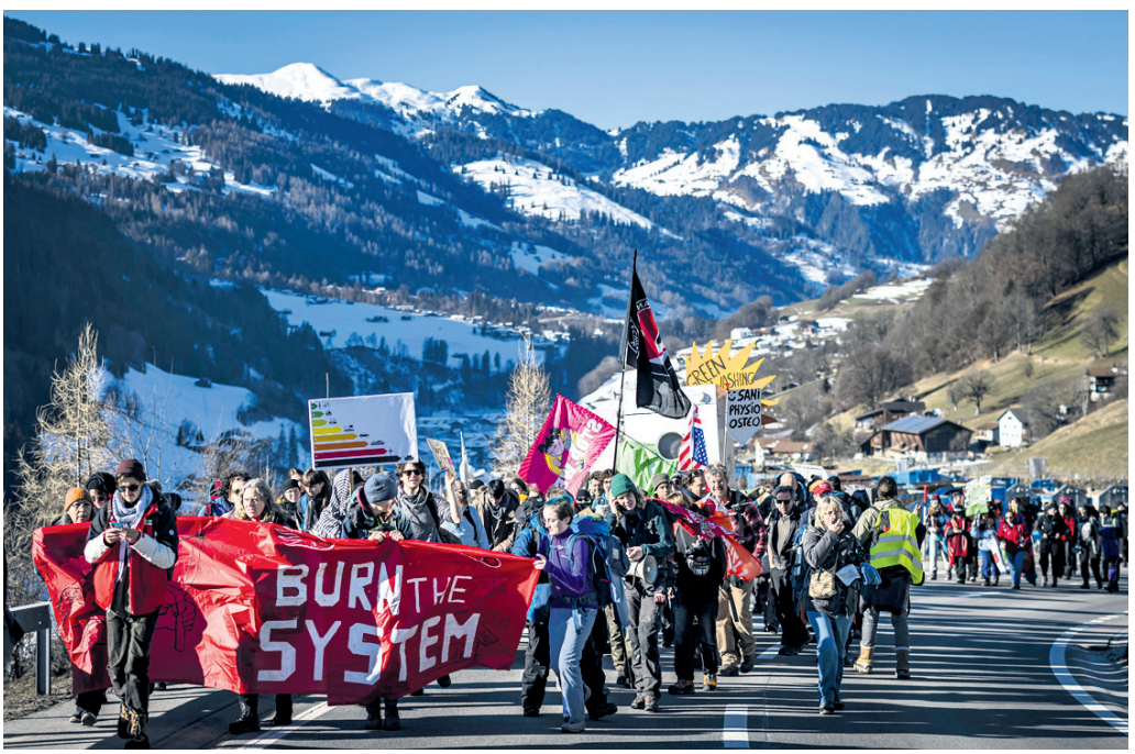
Protesters are seen on a two-day hike from Kueblis to Davos as part of a demonstration of the collective 'Strike WEF' in Switzerland, Saturday ahead of the annual meeting of the World Economic Forum, WEF, in Davos