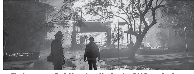
To be sure, fighting to eliminate GHG emissions amounts to provoking Goliath – a giant who profits enormously when we burn the fuels that are causing our homes to be gutted

of oil and natural gas, and historically the highest emitter of GHGs. The US Department of Defense is the world's largest institutional oil consumer, owing to America's involvement in wars around the globe.