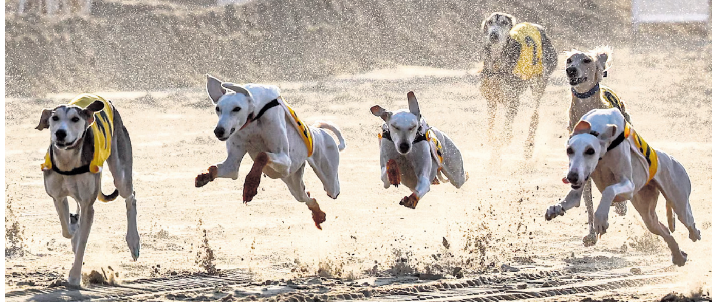
Greyhounds race in a championship during the Qatar International Falconry and Hunting Festival in Marmi