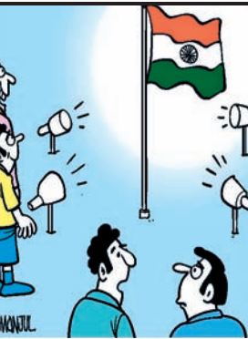
We decided to hoist a 3D holographic flag. Visible but not real... just like the republic