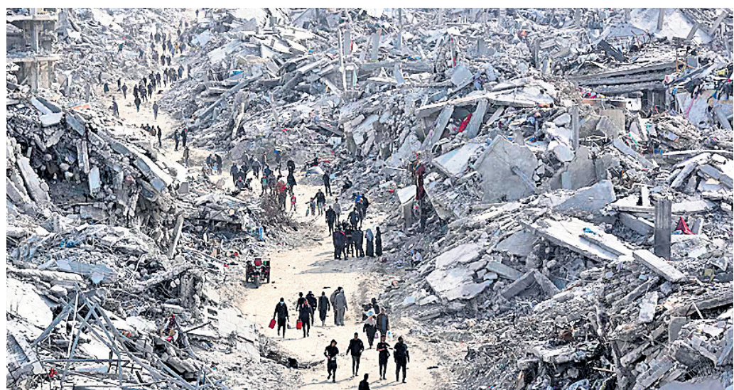
Displaced Palestinians return to the devastated Jabalya refugee camp in the Gaza Strip, shortly before a ceasefire deal in the war between Israel and Hamas was implemented