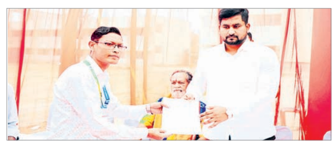
47 years, a release said. During his visit, the minister discussed about the overall development of the institution