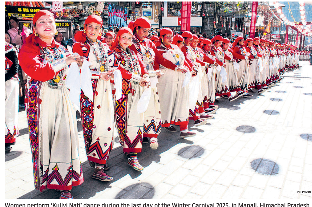
Women perform 'Kullvi Nati' dance during the last day of the Winter Carnival 2025, in Manali, Himachal Pradesh

marks came on a day the Opposition Congress hit out at the EC, saying its "self-congratulation" on the occasion would not obscure the fact that the poll panel's functioning had made a "mockery" of the Constitution and insulted the voters.