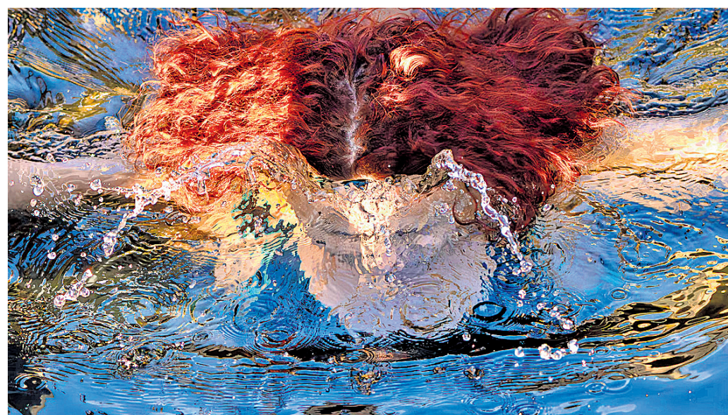
A woman plunges into icy water while celebrating the Orthodox Epiphany in the Stroginskaya floodplain of Moscow