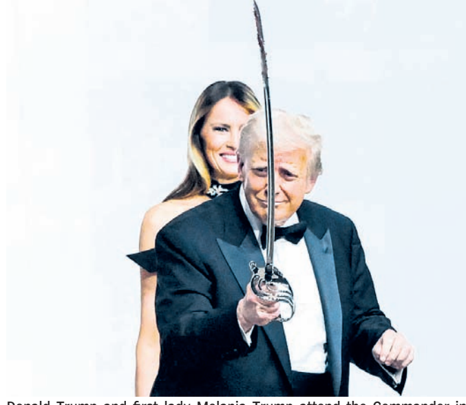
Donald Trump and first lady Melania Trump attend the Commander in Chief Ball in honor of his inauguration in Washington