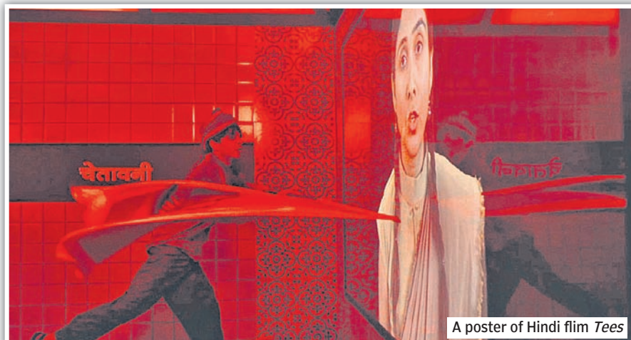
A poster of Hindi film Tees

► DB: Ayesha's character is deeply connected to broader societal issues, especially the ways in which women navigate patriarchal structures while trying to find autonomy within those confines. She represents a generation of women who, despite societal limitations, have created spaces for themselves. Ayesha's evolution throughout the film mirrors how individuals, especially older generations, respond to changing social dynamics in terms of family and identity. The personal struggles of her daughter, dealing with issues like sexuality and identity, contrast with her more traditional worldview. Yet, her acceptance of these struggles—like inviting a Hindu