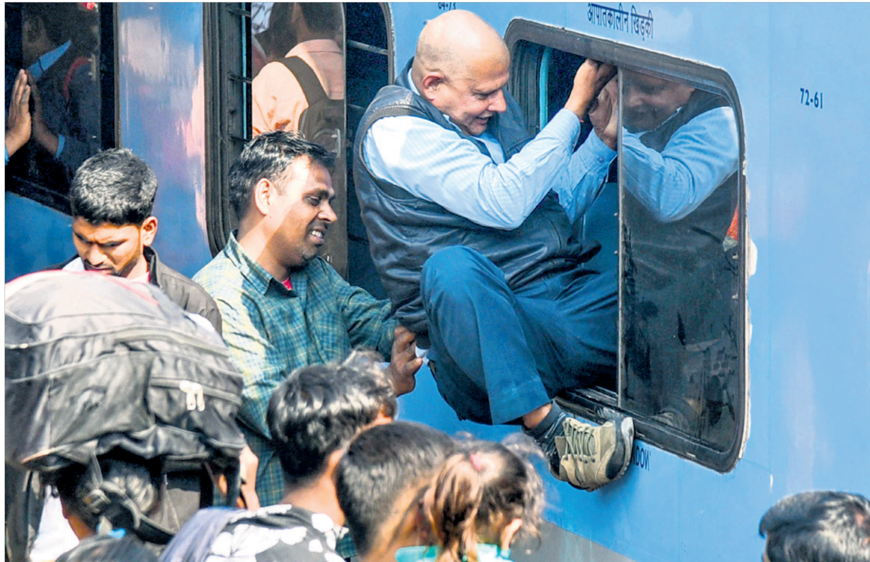
SHORT CUT: A passenger tries to board an overcrowded train through its emergency window at Patna railway station, Monday, as several trains were cancelled amid rush ahead of the holy dip on 'Maha Shivratri' at the ongoing Prayagraj Mahakumbh

Tough times for the airline! The minister has come prepared - with his own seat