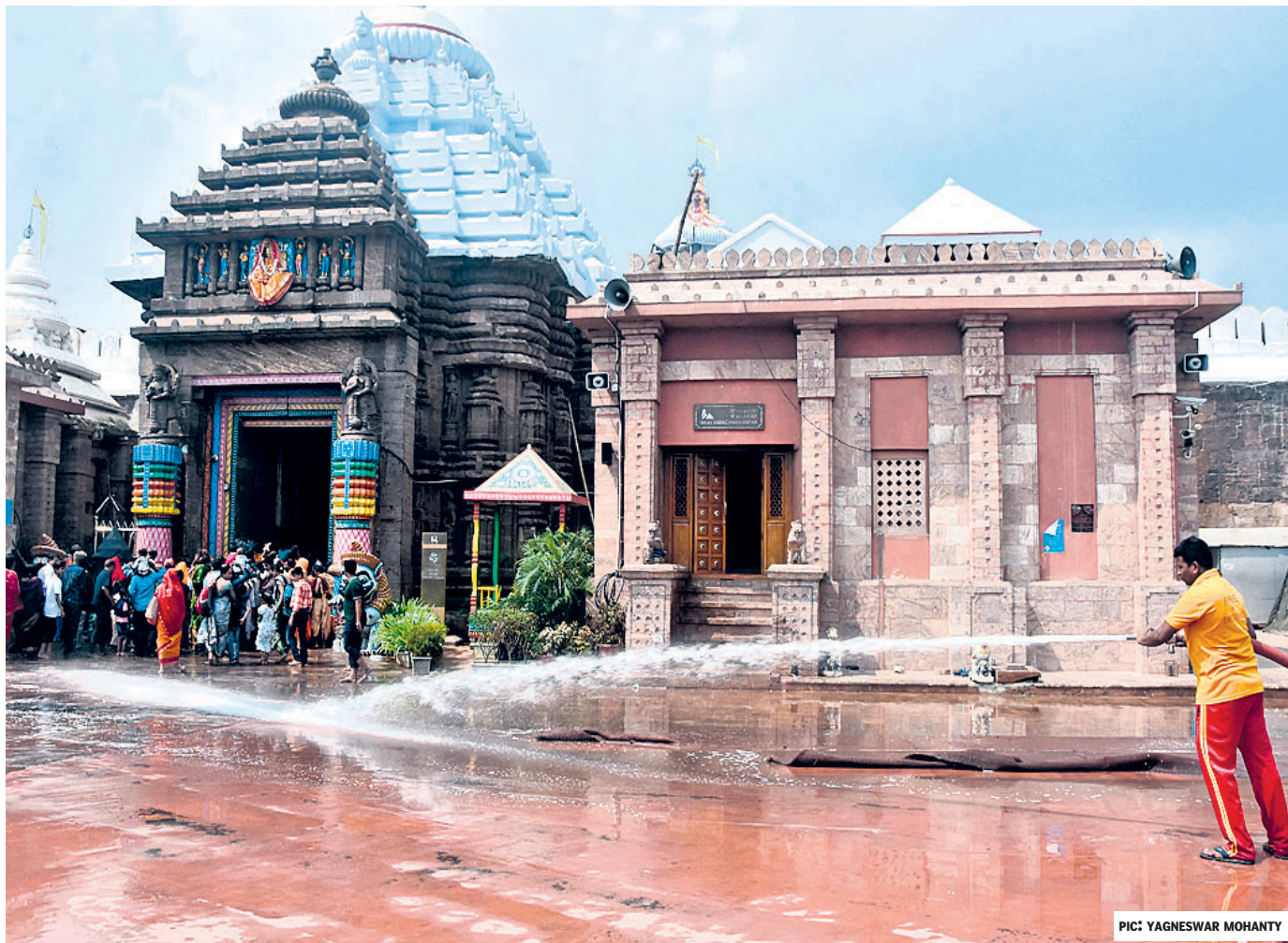
SUMMER'S HERE: Amid soaring temperatures, a Fire Services personnel sprays water on walkway near the Lion's Gate of Srimandir in Puri, Monday

"The Kashi Tamil Sangamam is not just an event — it is a bridge between the North and South, a celebration of shared traditions and cultural harmony. It reminds us that while our languages, customs, and practices may differ, our core values of love, respect, and spirituality remain the same. This cultural integration is what makes India a truly unique and vibrant nation," Majhi was quoted as saying in a release issued by the Chief Minister's Office.