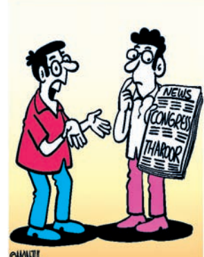
But, why send delegations when our supreme leader decides everything in the world?