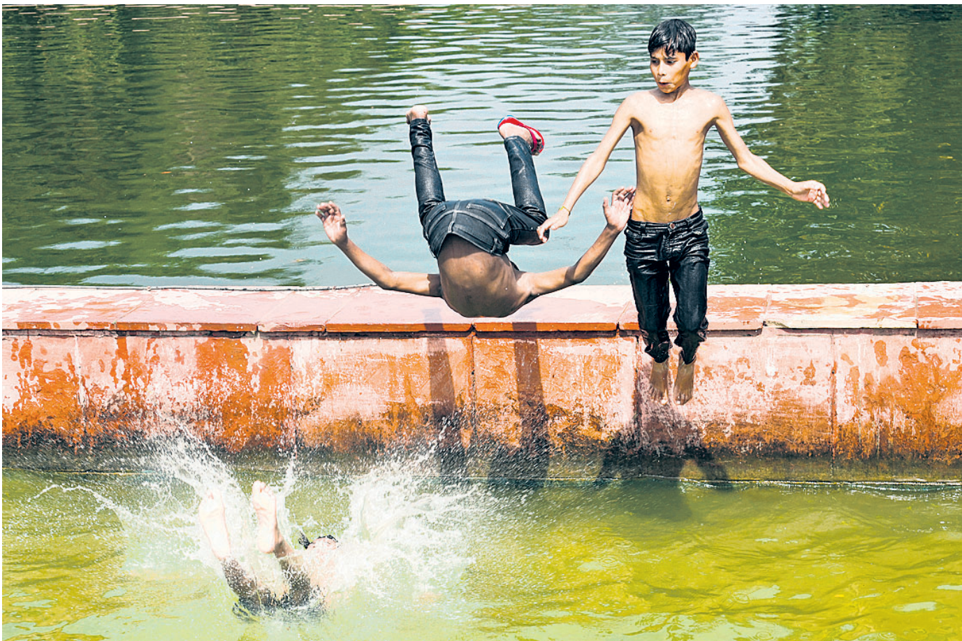
Boys play in a canal to cool off during a hot summer day, near Kartavya Path, in New Delhi, Saturday

"First of all, the prime minister should have responded to our demand for a special session of Parliament. We should have an outreach to Indian people, all the members of Parliament," he said.