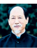
NEIPHIU RIO | CHIEF MINISTER, NAGALAND

Just as the wisdom of our forefathers has guided our communities, so too can it coexist with the formal legal system