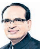
SHIVRAJ SINGH CHOUHAN | UNION MINISTER

We don't interfere with others, but if someone tries to create trouble for us, we don't spare them