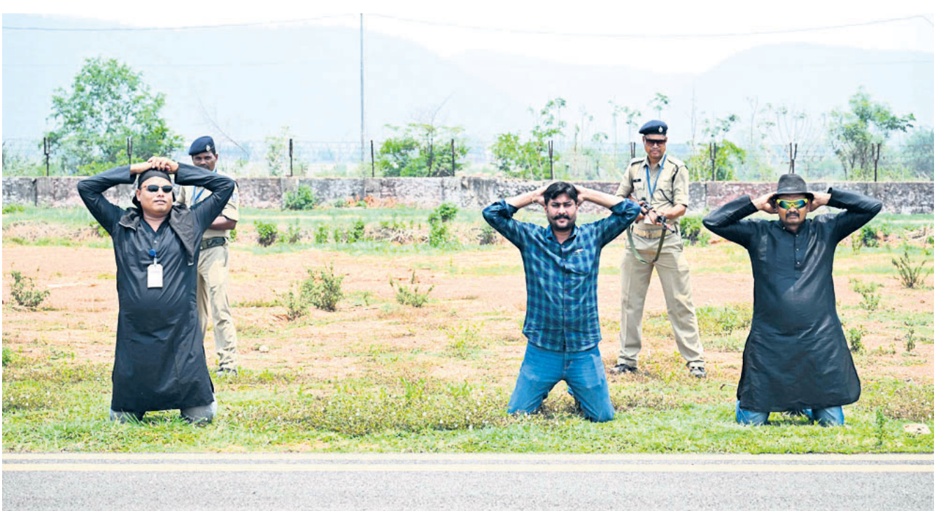
MOCK DRILL: An anti-hijacking mock exercise of flights underway at Rourkela Airport as per the guidelines of Security Bureau of Department of Civil Aviation, Saturday

Meanwhile, the NGT May 14 asked the Odisha SPCB to file an Action Taken Report (ATR) by May 20 regarding action taken against the Bargarh Municipality for failing to comply with the instructions of the apex green court.