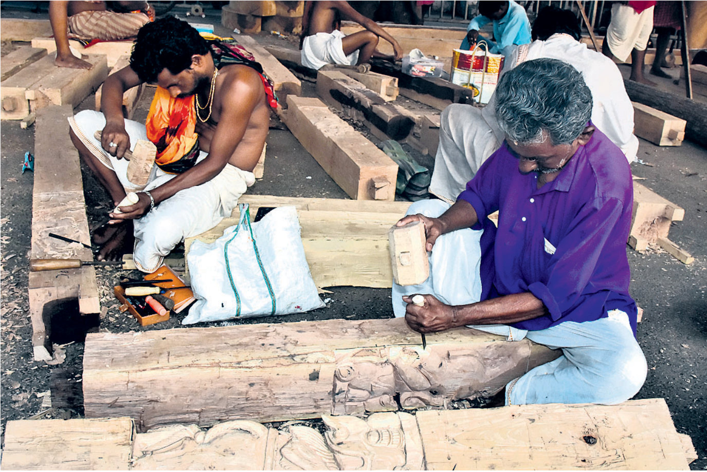
DEFT HANDS: Roopakar servitors carve intricate designs for chariots at Rath Yard in Puri, Saturday

the cooked ‘bhog’ by sitting on the floor with gratitude. “Mahaprasad holds immense religious significance and must be treated with the utmost reverence,” the administration emphasised. “Eating it on a dining table is considered disrespectful to the divine offering and contradicts the spiritual customs associated with it,” they added. In its advisory, the SJTA also called upon hotels, restaurants and eateries in Puri to discourage such practices and educate visitors on the proper way to consume the Mahaprasad. Establishments were urged to inform guests of its religious importance and the traditional manner of partaking in the sacred food. The administration said the photo and video of some people taking the Mahaprasad while sitting on a dining table has hurt the religious sentiments of scores of devotees.