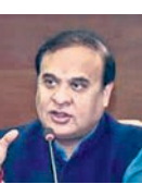
HIMANTA BISWA SARMA | CHIEF MINISTER, ASSAM

One of the MPs named in the list ( from Assam ) has not denied his prolonged stay in Pakistan—reportedly for two weeks—and credible documents show that his wife was drawing salary from a Pakistan-based NGO while working in India