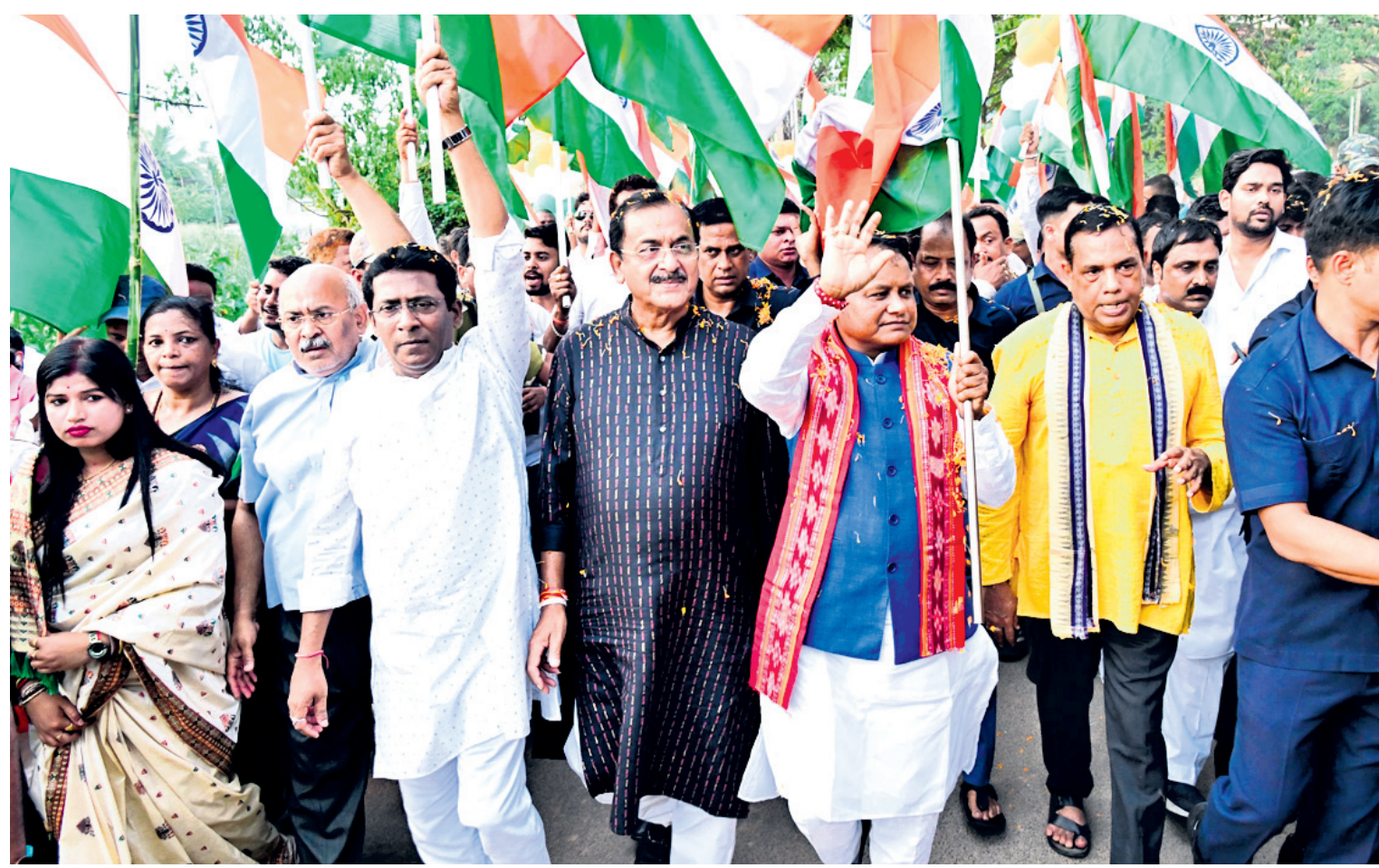
FLYING HIGH: Chief Minister Mohan Charan Majhi leads a Tiranga Yatra in Ekamra Assembly constituency in Bhubaneswar to honour the Indian armed forces for their resounding success in Operation Sindoor, Saturday