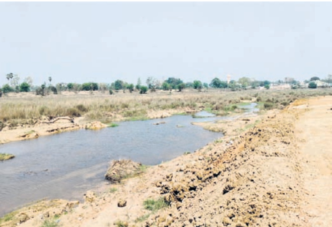
PNN & AGENCIES

Jeera water not even suitable for bathing: SPCB tells NGT