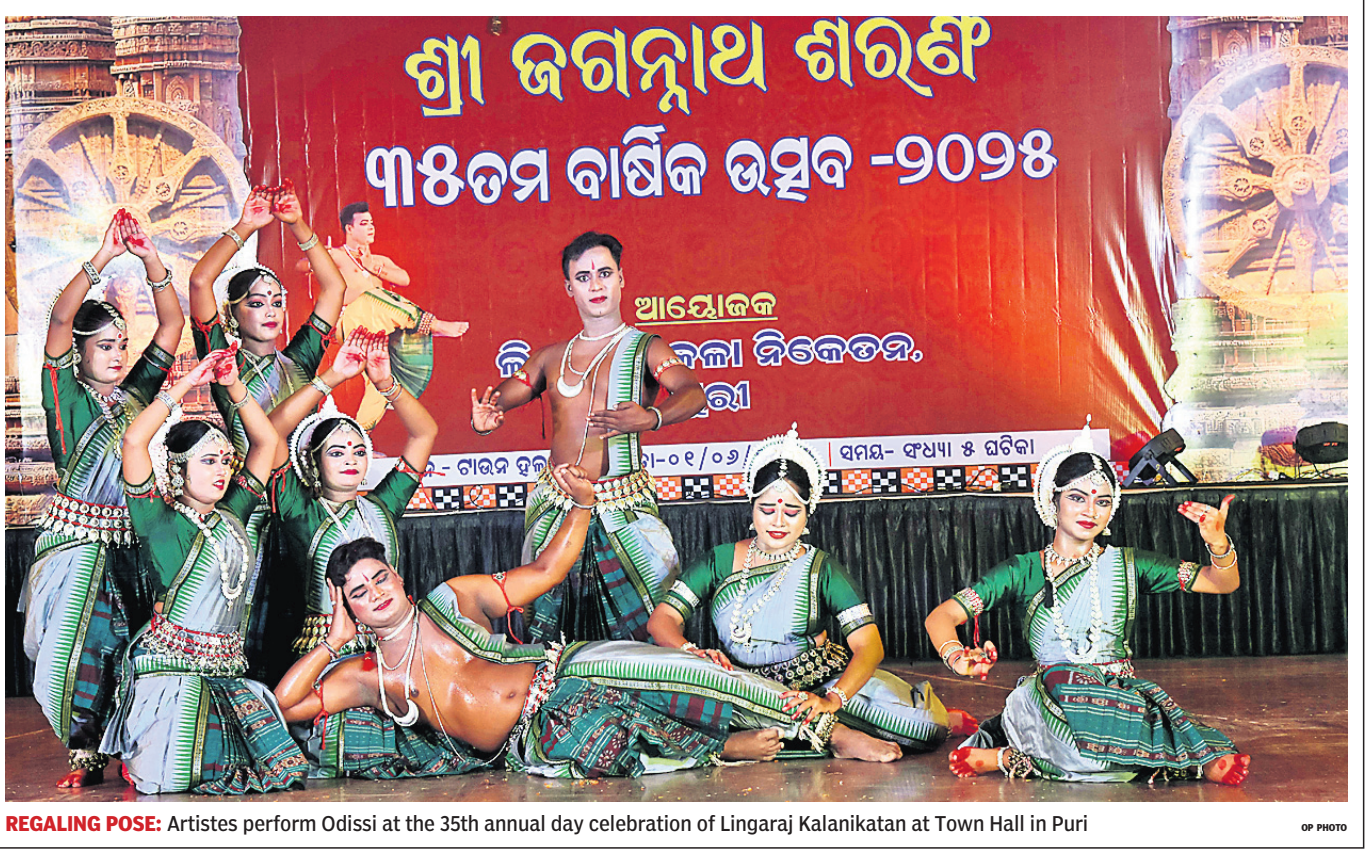
REGALING POSE: Artistes perform Odissi at the 35th annual day celebration of Lingaraj Kalanikatan at Town Hall in Puri