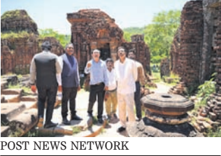
POST NEWS NETWORK

Bhubaneswar, June 2: Governor Dr Hari Babu Kambhampati, who is now in Vietnam to bring back the holy relics of Lord Buddha to India, visited the famous My Son temple complex in Quang Nam province Sunday. The UNESCO World Heritage Site is being restored with help from the Archaeological Survey of India (ASI). My Son is one of Vietnam’s most valued cultural sites, with some of its Hindu temples dating back to 4th century. These old temples were built by the