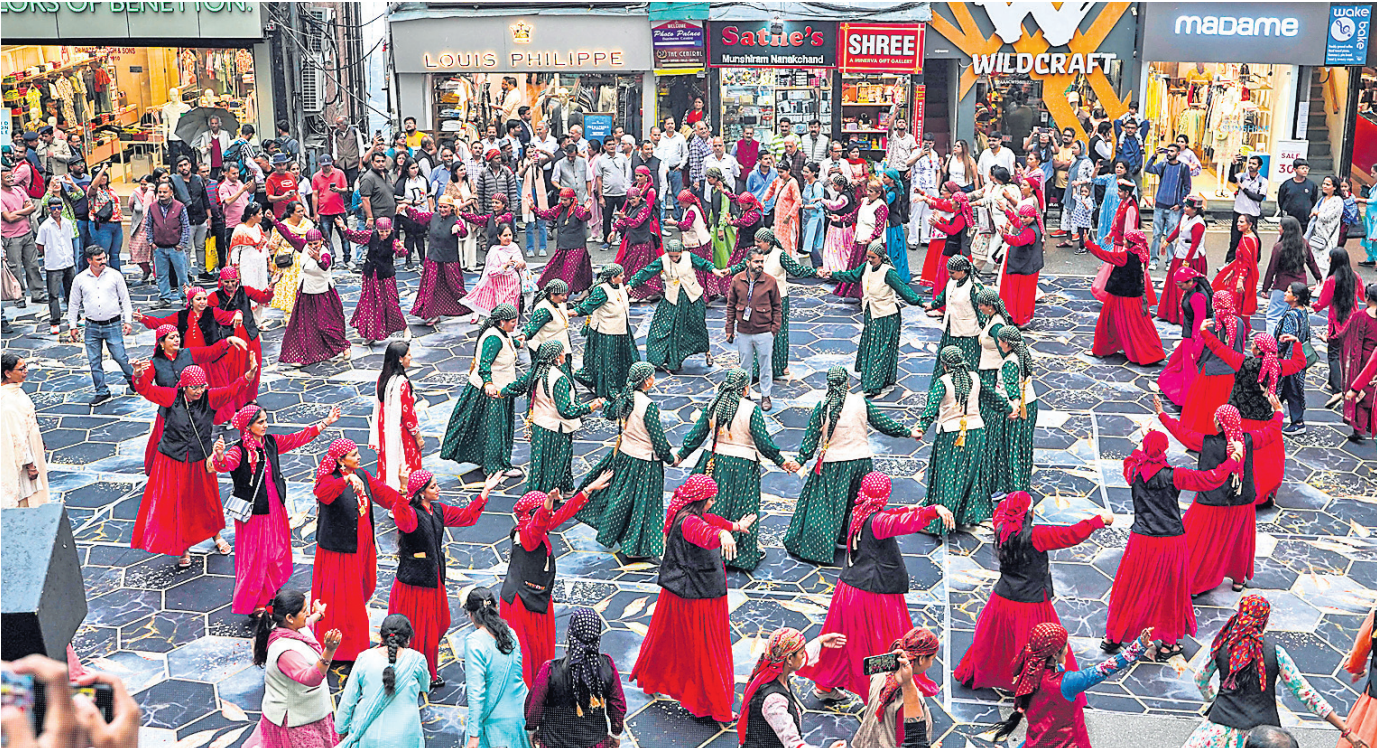
Women dance during the Shimla Summer Festival

Crops grown using natural methods are more nutritious, and the absence of chemicals helps preserve the soil's fertility and quality as well.