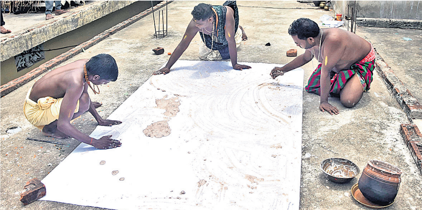
AT LORD’S SERVICE: Chitrakar servitors prepare a canvas for ‘Patti Dian’ ahead of the Rath Yatra festivities in Puri, Monday