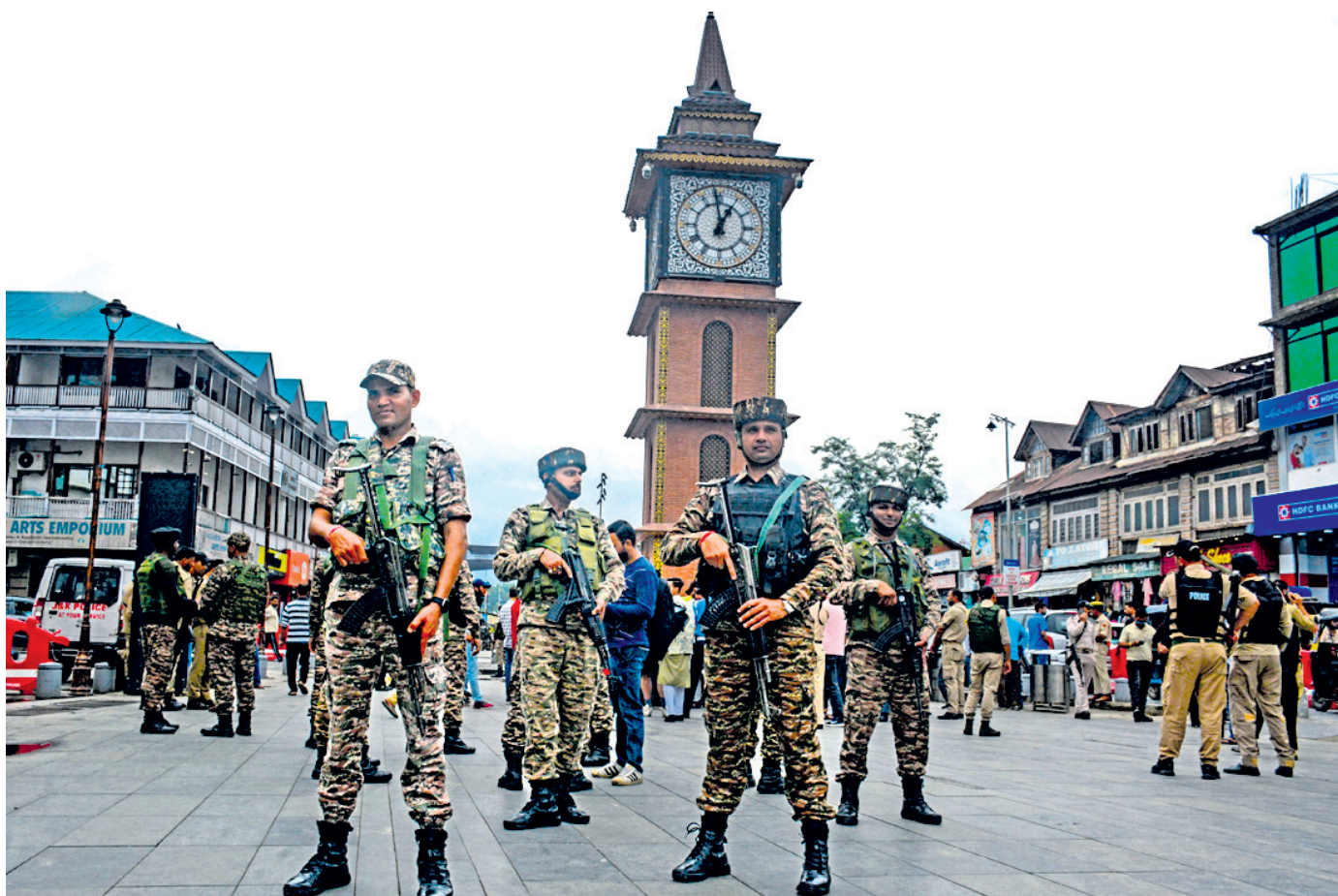
Security personnel keep vigil amid heightened security during the ongoing Amarnath Yatra, in Srinagar

"Should any extraneous cir- cumstance present itself and the 48-hours timeline cannot be complied with, the reason for the delay shall be duly re- corded in the case diary," it said. Throughout the process requisite efforts were ordered to be made to preserve samples according to the requirements.