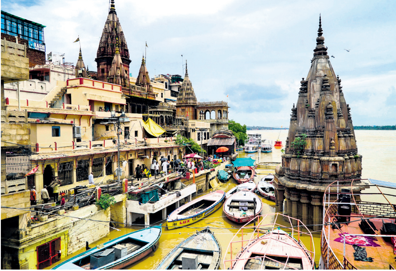
Boats float in water of the swollen Ganga river inundating Manikarnika Ghat, in Varanasi, Uttar Pradesh, Tuesday