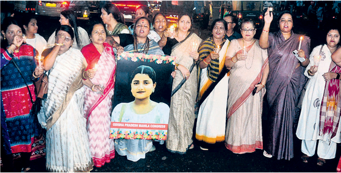
Members of the women wing of the state Congress take out a candlelight rally seeking justice for the FM (Autonomous) College victim, at Master Canteen Square in Bhubaneswar, Tuesday

CM announces ₹20L ex gratia BHUBANESWAR: Chief Minister Mohan Charan Majhi Tuesday announced ex gratia of Rs 20 lakh for the family of the college student who died by setting herself on fire over alleged inaction on her sexual harassment complaint. Majhi directed officers concerned to conduct a proper investigation into the incident so that all guilty are punished in accordance with the law, according to a statement issued by the CMO. Governor Hari Babu Kambhampati also expressed grief over the death of the student. “Shattered to learn of the untimely loss of a young student from Fakir Mohan Autonomous College. Her passing is not just a tragedy—it is a stark reminder of the urgent need to safeguard our campuses,” he said in a post on X. “The law will take its toughest course. Those responsible will face uncompromising punishment. My heart goes out to the grieving family. May they find strength in this hour of unbearable pain,” he added.