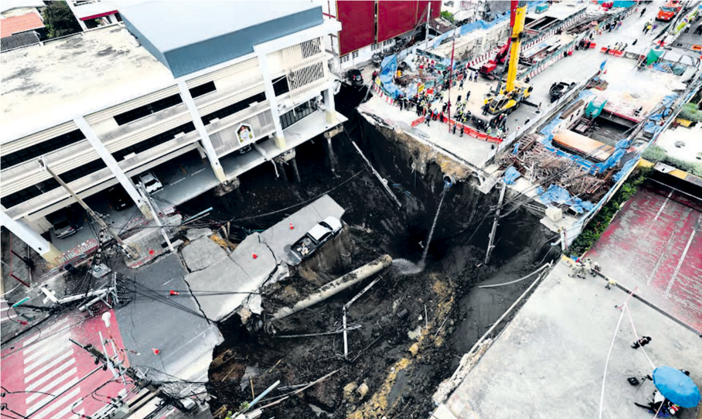
A massive sinkhole opens in Samsen Road near Vajira Hospital, in Bangkok, Thailand, Wednesday

Ukrainian President Volodymyr Zelenskyy called on world powers Wednesday to work together to stop Russia's war in his country, accusing Russian President Vladimir Putin of