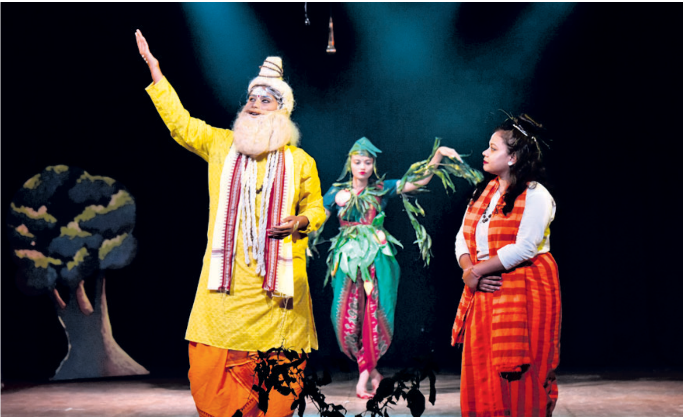
ENACTING A PLAY: Students from Shailabala Women's College Sanskrit department stage the play 'Vruksha Rakshati Rakshitah' at 'Dasharupakam-2025', a three-day Sanskrit theatre festival organised by 'The Catch' at Bhanjakala Mandap, Bhubaneswar, Wednesday