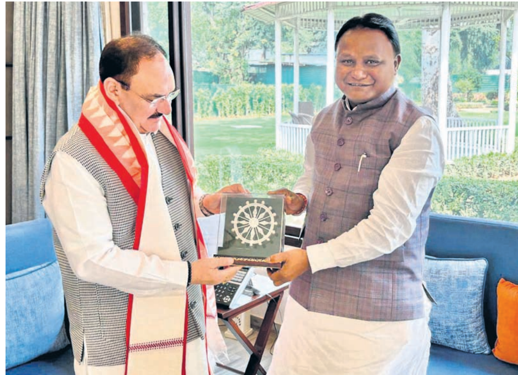
Chief Minister Mohan Charan Majhi meets BJP national president and Union Health Minister JP Nadda in New Delhi, Saturday