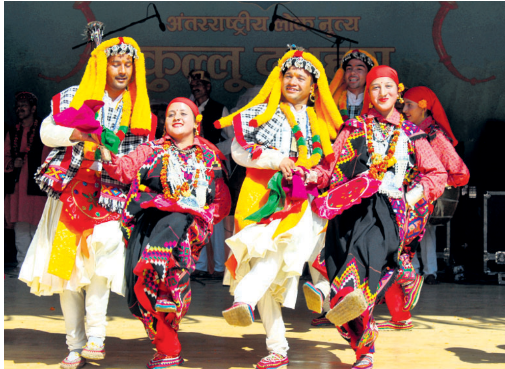
Artistes perform ‘Nati’, a traditional folk dance, at the International Dussehra festival in Kullu, Himachal Pradesh

Five others were also arrested during the operation, it said. “The successful operation has dealt a crippling setback to UKNA’s networks in Churachandpur and Jiribam, reaffirming Assam Rifles’ relentless commitment to peace and security in the region,” the statement said. Officials in Manipur said the UKNA commander was allegedly involved in the killing of four members of the Meitei community, including a father and son, in Bishnupur district in January 2024.