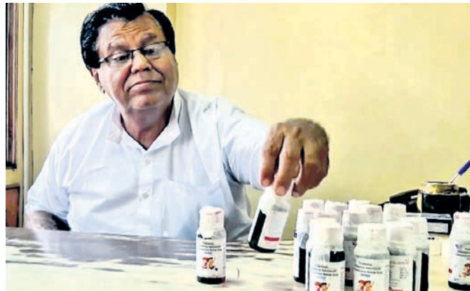
An official looks at bottles of the 'Coldrif' cough syrup after a raid by the Drug and Pharmaceuticals Department officials at Kataria Pharmaceuticals in Jabalpur, Madhya Pradesh, Saturday

New Delhi, Oct 4: A specific cough syrup, Coldrif, has been found to contain diethylene glycol (DEG) beyond the permissi-