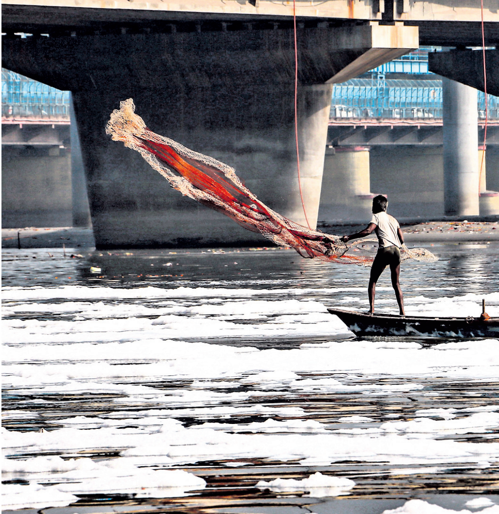
A fisherman casts a net in the Yamuna river partially covered in toxic foam, in New Delhi, Saturday

to be transparent, consumer friendly and socially responsible, officials said. The committee is likely to come up with a draft of the policy in coming months. In the meetings of the committee in recent past, various issues like stagnant prices, legal age of drinking, and role of private players in retail trade have been discussed with stakeholders including liquor manufacturers as well as retailers, sources said. The excise tax rate in Delhi has not been revised since 2014 and MRP was last updated three years ago, a source said. Pricing of liquor including fixed margins per bottle are certain issues being deliberated as part of drafting the policy, the source added. The fixed margins per bottle in Delhi put all kinds of liquor in one segment, encouraging retail vendors to stock cheaper, less popular brands. This also encourages brand pushing and unavailability of more popular brands and high end liquor, the sources added.