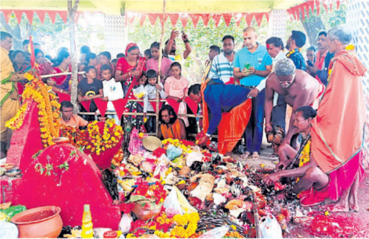
POST NEWS NETWORK

Bolangir, Dec 23: The famous Shulia Jatra, a centuries-old festival symbolising tradition and faith, was held Tuesday at Khaigura Badakhala and Kumorura Sanakhala under Kulutapada panchayat in Deogaon block of Bolangir district. Despite intense cold and dense fog, lakhs of devotees from Bolangir, Kalahandi, Boudh, Sonepur and Phulbani districts congregated at the twin shrines from early morning, and as per the age-old tradition, offered large-scale animal and bird sacrifices, leaving both ritual sites soaked in blood. Devotees from the Kandha tribal community reached the shrines in procession from