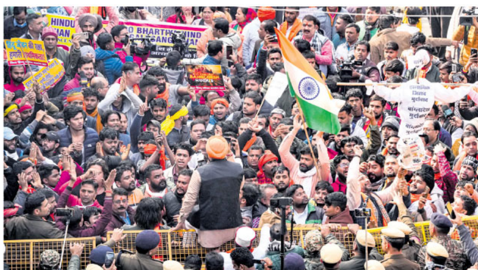
OUTRAGE: Vishwa Hindu Parishad and Bajrang Dal members wave the national flag during a protest outside the Bangladesh High Commission over attacks on Hindus in the neighbouring country in New Delhi, Tuesday

New Delhi, Dec 23: Pro- tests erupted Tuesday in