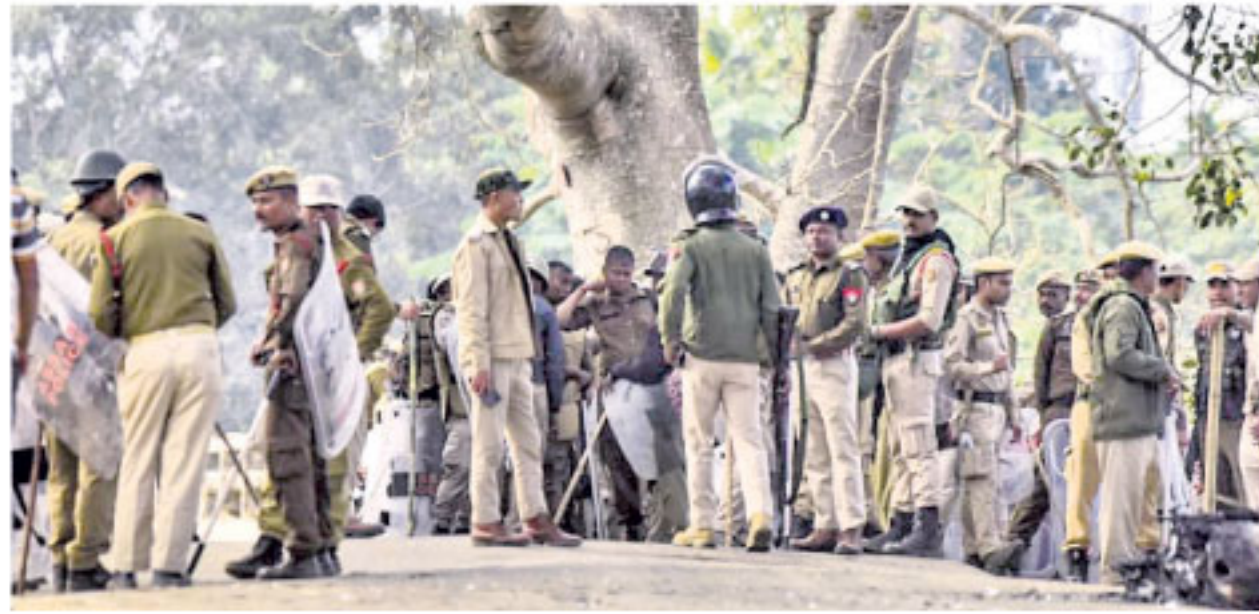
Security personnel keep vigil following a wave the violence

Both the groups were agitated, and the security forces deployed in the area tried to pacify them, but suddenly stone pelting began from both sides, injuring several protestors, police personnel and media persons covering the incident, a senior police officer said. As the situation spiralled out