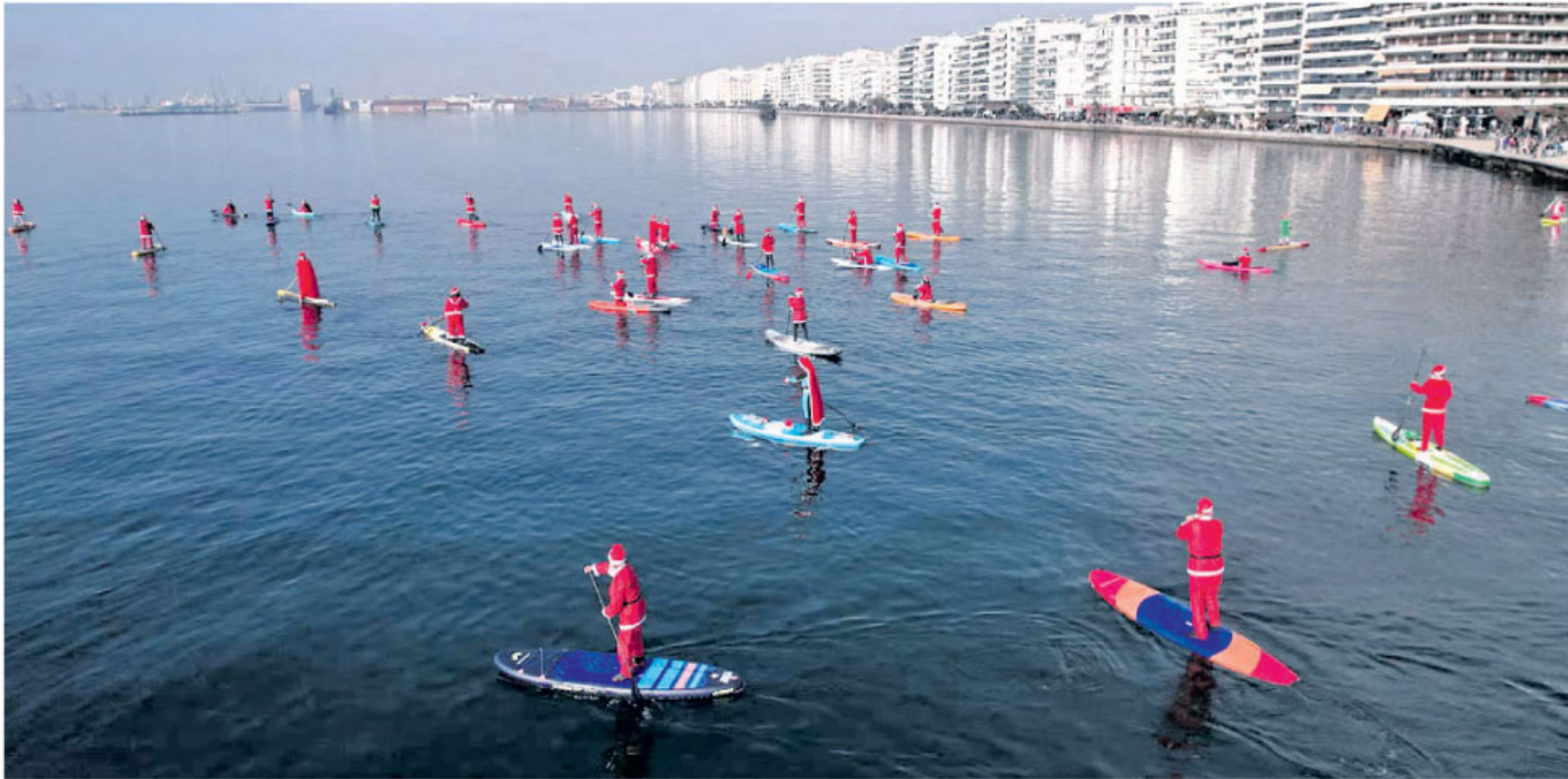
Paddleboarders wearing Santa Claus costumes off the seafront of Thessaloniki, Greece

She was detained along with 478 people and expelled by Israel in October after joining an activist convoy of vessels, the Global Sumud Flotilla, that attempted to reach Gaza with aid supplies. Israel has consistently denied genocide allegations.