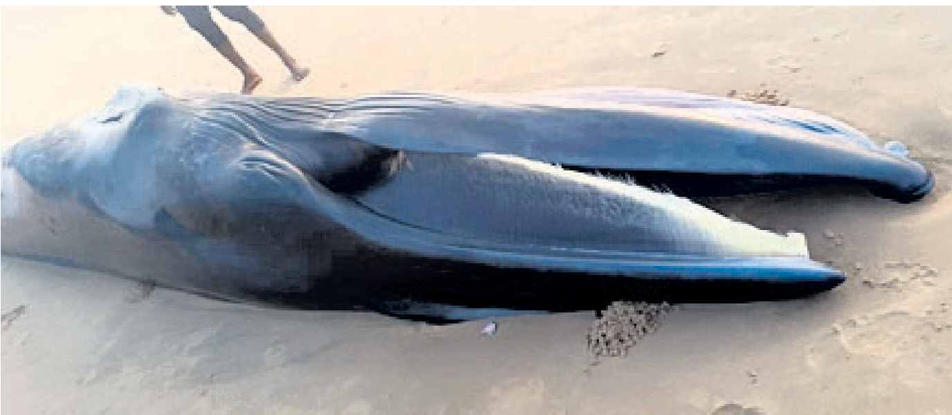
The decomposed carcass of a giant whale at Devi River mouth in Jagatsinghpur, Saturday