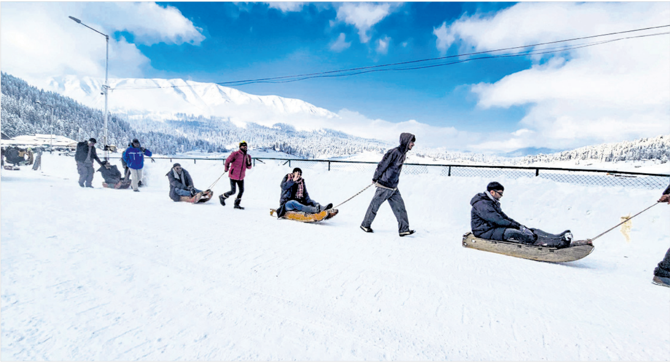
Visitors enjoy sledge rides after snowfall, in Gulmarg, Jammu and Kashmir

ous injections January 22. Blaming the village Sarpanch and Gram Panchayat secretary for the gruesome act, the complaint alleged that the former hired few individuals to kill the strays. Based on the complaint, police registered an FIR against the duo under relevant sections of BNS and Prevention of Cruelty to Animals Act, police said Saturday.