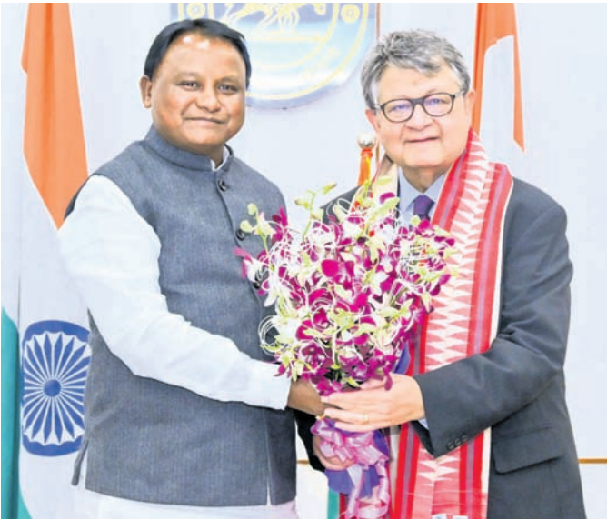
CM Mohan Charan Majhi with NITI Aayog Vice Chairman Suman Bery

The CM sought support of NITI Aayog for the development of BCPPER. “He (the CM) underlined that the proposed economic region, with nearly 90 priority projects, has the potential to transform Odisha’s urban and industrial landscape and requested NITI Aayog’s guidance and support, including funding