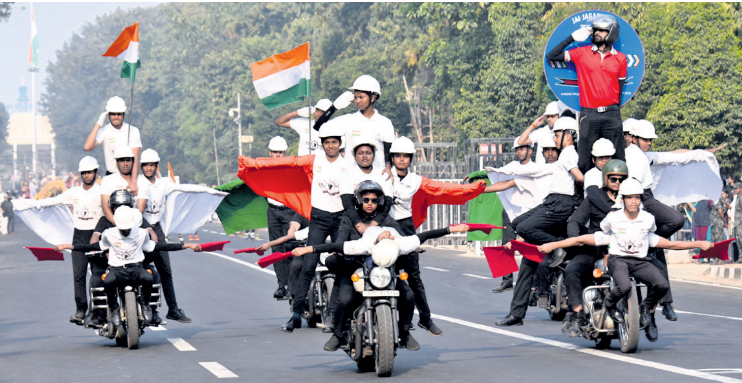
R-DAY PREP: Youths perform a daredevil show during the full dress rehearsal ahead of the Republic Day celebrations at Mahatma Gandhi Marg in Bhubaneswar, Saturday

“Is the Odisha Chief Minister unable to control this situation, or is the BJP encouraging it? If the Chief Minister is unable to protect the minority community, then he should resign,” Patra said. The protestors were picked up from the agitation site and later released, police said.