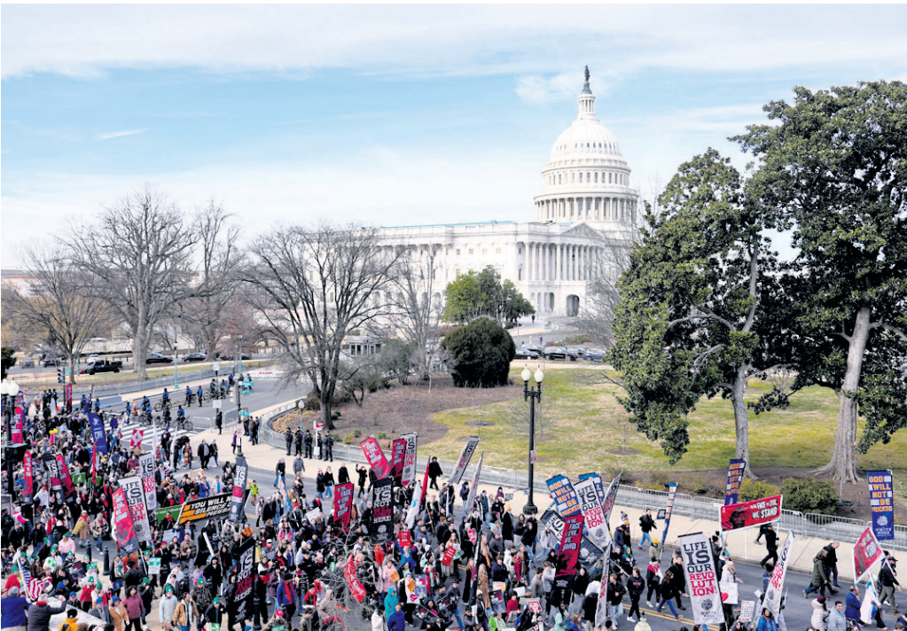
Anti-abortion demonstrators walk past the U.S. Capitol on their way to the Supreme Court during the annual March for Life in Washington, Friday

In his message Saturday, Trump continued his provocations by calling Canada's leader "Governor Carney." Trump had used the same nickname for Carney's predecessor, Justin Trudeau, and his use of it toward Carney was the latest mark of their soured relationship.