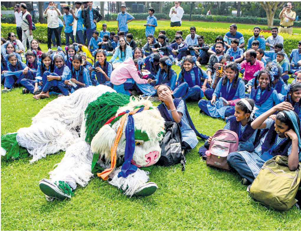
An artiste performs Tibetan dance during the 'Kala Ghoda Arts Festival', at Chhatrapati Shivaji Maharaj Vastu Sangrahalaya, in Mumbai, Maharashtra

Hyderabad: A Maharashtra man, a father of three children, who aspired to contest local body elections in the state, allegedly killed his six-year old daughter by throwing her into a canal in Telangana to be eligible to contest panchayat polls, police said Monday. Those having more than two children are ineligible to contest local polls in Maharashtra. The 28-year-old man, a resident of Kerur village in Mukhed taluka of Nanded district in Maharashtra, bordering Telangana, came towards Nizamabad district along with his daughter on a bike January 29 and threw her in a canal. Local residents after noticing the girl's dead body in the canal informed the police.