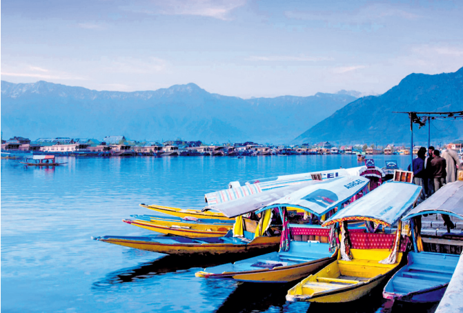
PRESS TRUST OF INDIA

Jammu and Kashmir recorded 1.78cr tourist visits in 2025 despite security incidents, natural calamities