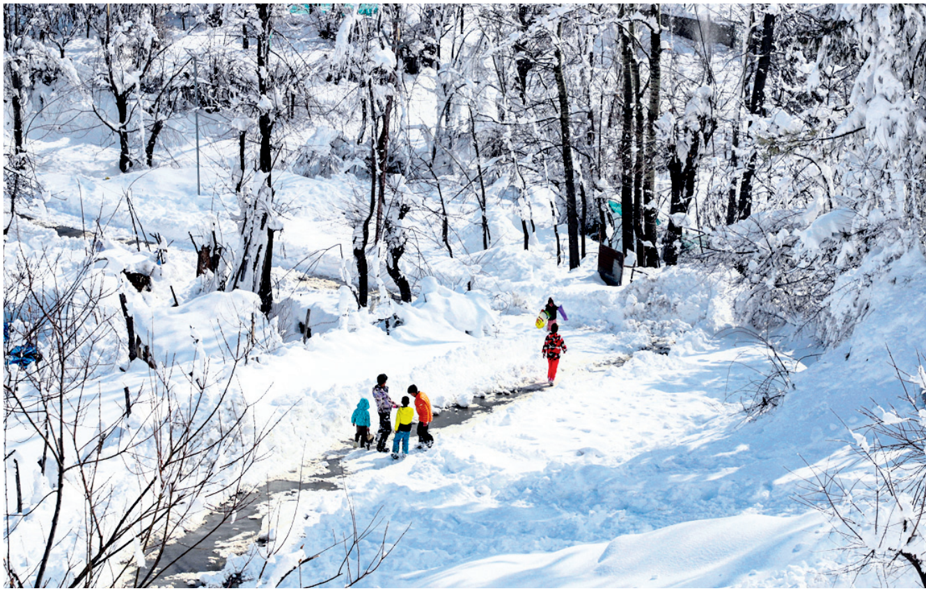
Children play on a snow-covered road after fresh snowfall, in Tangmarg, Baramulla district, Monday