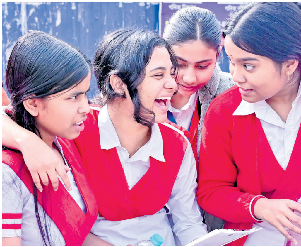
Class X students share a light moment after appearing for the first exam of the West Bengal Board of Secondary Education (WBBSE) outside an examination centre, at Balurghat

Later, the man moved the high court aggrieved by cancellation of his candidature.