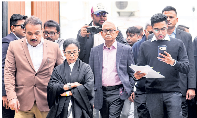
West Bengal CM Mamata Banerjee and TMC MP Abhishek Banerjee, in South Avenue area, New Delhi

Talking to the media after coming out of the Election Commission's headquarters here, the West Bengal CM launched a fresh tirade against the poll panel, accusing it of working as