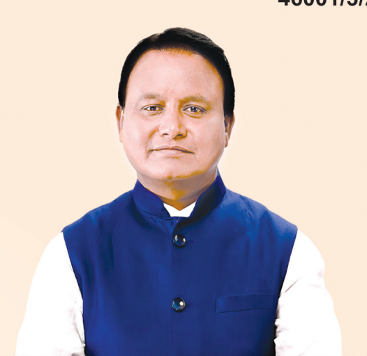
ଶ୍ରୀ ମୋହନ ଚରଣ ମାଝୀ ମୁଖ୍ୟମନ୍ତ୍ରୀ, ଓଡ଼ିଶା

ସାମାଜିକ ସୁରକ୍ଷା ଓ ଲିଙ୍ଗଗତ ସମାନତା ପାଇଁ ଓଡ଼ିଶା ସରକାରଙ୍କର ଏକ ଅଗ୍ରଗାମୀ ପଦକ୍ଷେପ