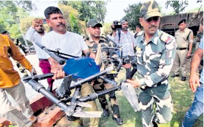
INDO-ASIAN NEWS SERVICE

New Delhi, Feb 2: Indian agencies have busted several plots hatched by ISI-backed terrorists, which were aimed at carrying out strikes in India. What the Indian agencies have learnt in recent months is that Pakistan has set up multiple networks within the country aimed at disturbing peace.