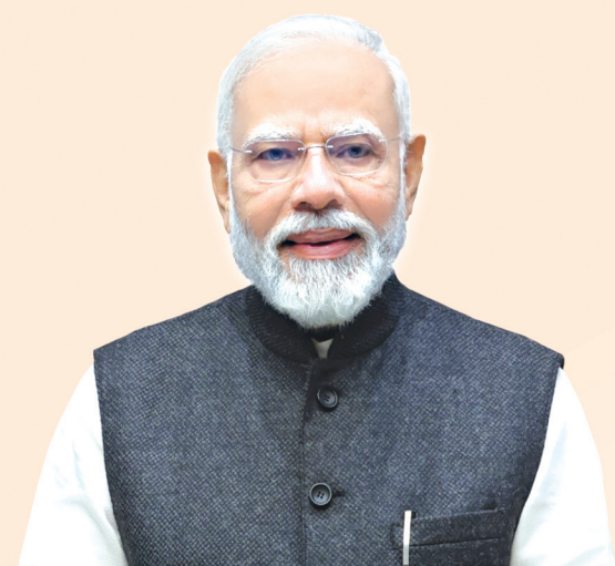
ଶ୍ରୀ ନରେନ୍ଦ୍ର ମୋଦୀ ପ୍ରଧାନମନ୍ତ୍ରୀ